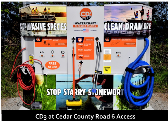
CD3 at Cedar County Road 6 Access

CLCC and the Wright Soil and Water Conservation District (WSWCD) are pleased to announce the addition of a second CD3 (clean, drain, dry, dispose) station on Cedar Lake in Wright County. The new CD3 station—installed on May 25th—can be found at the County Road 6 public access. The first is at Schroeder Park.