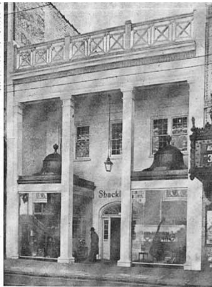
Shackleton Piano Company wanted no ultramodern architecture for its new store.