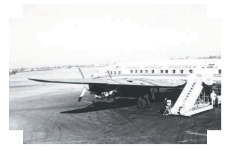
A TWA Lockheed Constellation photographed from the observation deck as noted in the story.

I really don't know why the observation deck closed at Standiford Field. I am sure that it was a combination of things including liability, construction, and waning interest. Still a 1967 Courier-Journal article noted that some warm weather months saw as many as 6000 visitors go through the turnstile and that was a lot of dimes. It would be nice if the airport brought back an observation deck, even if it was indoors. I know that I would spend time there. My dime is ready. By-the-way, Cincinnati/ Northern Kentucky International Airport still has an observation parking area on the east side of the field. It has picnic tables, portable restrooms, and seems a popular place. See: it can be done!