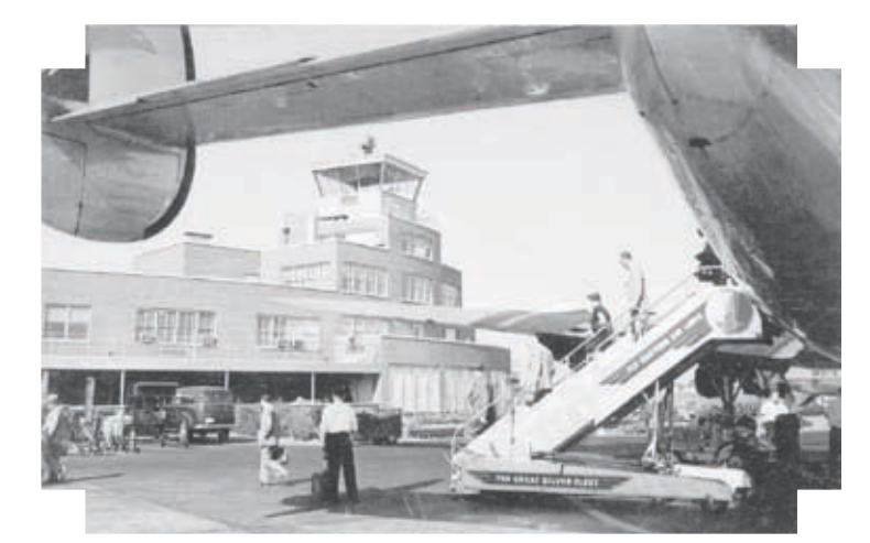
An early Standiford Field postcard shows passengers leaving an Eastern Air Lines Constellation.