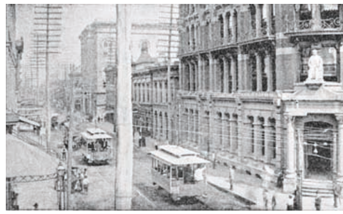
Central Passenger Railway in 1889 adjacent to the old Courier-Journal building, looking east on Green from Fourth Street. It came from The Street Railway Journal. Photo submitted by Jim Dalmas

Hours of Operation: 8:00a.m. - 4:45p.m. 7 days a week Please visit our website at cavehillcemetery.com