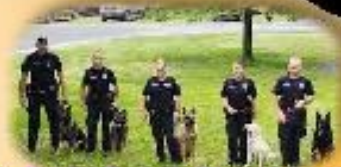
Berks County Sheriff Dept. K9 Unit Demo

Breakfast Sandwiches, Burgers, Hot Dogs, Ice Cream, Snacks, Hot & Cold Beverages provided by Oley Fire Company Fairgrounds