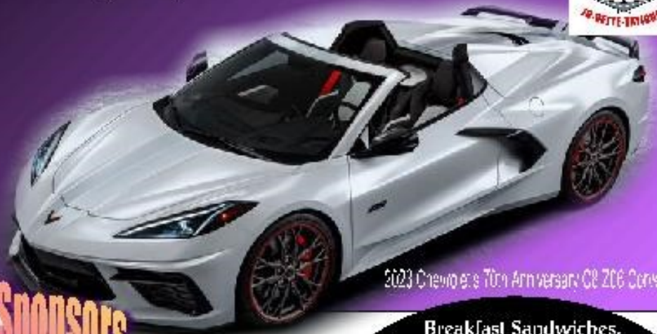
2023 Chevrolet 70th Anniversary CE Z06 Corvette

Opening Ceremony 9:30 am featuring local high school Jr. ROTC Color Guard & Veterans