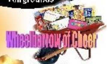
Wheelbarrow of Cheer

Breakfast Sandwiches, Burgers, Hot Dogs, Ice Cream, Snacks, Hot & Cold Beverages provided by Oley Fire Company Fairgrounds