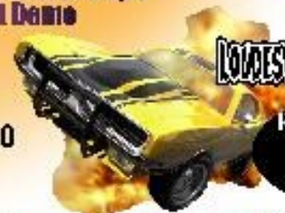
LOWEST EXHAUST COMPETITION

Roar your Engines to Win a Special Trophy