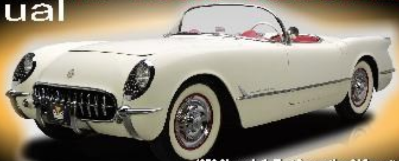
1953 Chevrolet's First Generation C1 Corvette

Corvettes, Along with All Makes & Models of Cars & Trucks - Antique, Custom, Classic & Street Rods Welcome