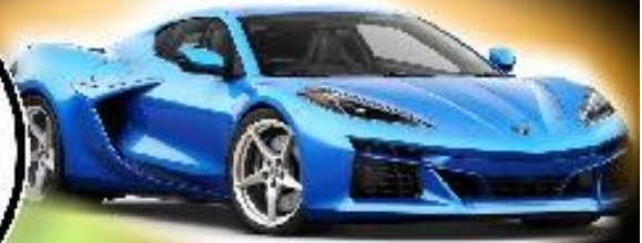
2024 Corvette C8 Generation E-Ray