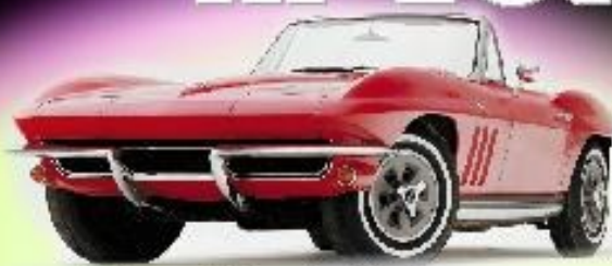
1964 Corvette C2 Generation Sting Ray