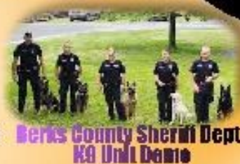
Berks County Sheriff Dept. K9 Unit Demo

Breakfast Sandwiches, Burgers, Hot Dogs, Ice Cream, Snacks, Hot & Cold Beverages provided by Oley Fire Company Fairgrounds