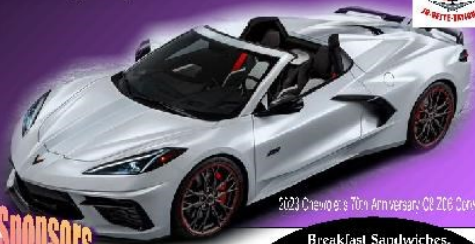
2023 Chevrolet 70th Anniversary CE Z06 Corvette

Opening Ceremony 9:30 am featuring local high school Jr. ROTC Color Guard & Veterans