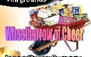
Wheelbarrow of Cheer

Breakfast Sandwiches, Burgers, Hot Dogs, Ice Cream, Snacks, Hot & Cold Beverages provided by Oley Fire Company Fairgrounds