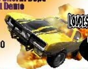
LOWEST EXHAUST COMPETITION

Roar your Engines to Win a Special Trophy