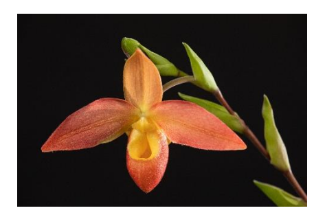
Phrag. Don Wimber