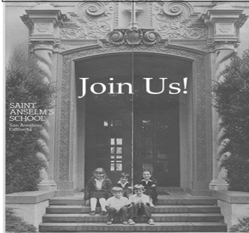
100th Year Centennial Celebrations St. Anselm School

WORLD DAY OF THE SICK, FEBRUARY 10, 2024- The Order of Malta San Francisco Location is hosting the World Day of the Sick Mass and Anointing of the Sick at St. Dominic’s Church, 2390 Bush St. on February 10, 2024 at 11:00am.