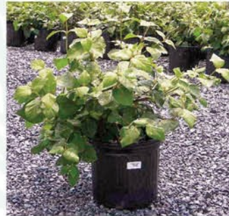
VIBURNUM CARLESII KOREAN SPICE VIBURNUM

Height: 4 - 6', Foliage: Green, Spread: 5 - 8', Fall Foliage: Yellow- orange, Zone: 4 - 7, Shape: Upright