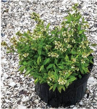
VACCINIUM AUGUSTIFOLIUM LOWBUSH BLUEBERRY

Grows well in acidic, poor soils. Edible berries.