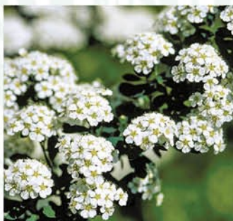
SPIRAEA NIPPONICA 'SNOWMOUND' SNOWMOUND SPIREA

Height: 18", Foliage: Green-red, Spread: 24", Fall Foliage: Red-orange, Zone: 2 - 10, Shape: Round