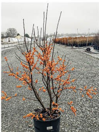
ILEX VERTICILLATA 'WINTER GOLD' WINTER GOLD WINTERBERRY

Height: 10 - 12', Foliage: Dark green, Spread: 8 - 10', Fall Foliage: Yellow, Zone: 4 - 9, Shape: Upright, round