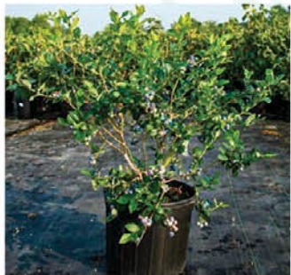
VACCINIUM X DUKE DUKE BLUEBERRY

Height: 5 - 6', Foliage: Green, Spread: 4 - 6', Fall Foliage: Red, Zone: 4 - 7, Shape: Upright