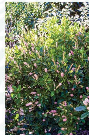
CLETHRA ALNIFOLIA 'RUBY SPICE' RUBY SPICE PINK SUMMERSWEET

Height: 3 - 4', Foliage: Green, Spread: 6 - 8', Fall Foliage: Yellow, Zone: 4 - 9, Shape: Spreading