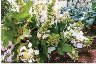
HYDRANGEA QUERCIFOLIA OAKLEAF HYDRANGEA

Dark green shaped leaf shrub with large, white flowers turning pink in Fall.