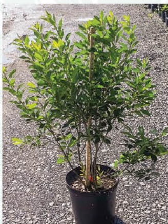
ILEX VERTICILLATA 'SOUTHERN GENTLEMAN' SOUTHERN GENTLEMAN WINTERBERRY

Height: 3 - 5', Foliage: Green, Spread: 3 - 5', Fall Foliage: Yellow, Zone: 3 - 9, Shape: Round