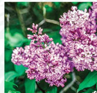
SYRINGA VULGARIS COMMON LILAC

Height: 6 - 7', Foliage: Blue-green, Spread: 5 - 6', Fall Foliage: Red, Zone: 3 - 7, Shape: Upright