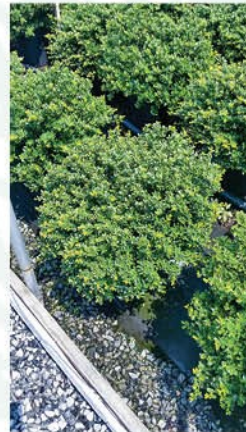
ILEX CRENATA 'HELLERI' HELLERI DWARF JAPANESE HOLLY

Height: 2 - 3', Foliage: Glossy green, Spread: 4 - 6', Fall Foliage: N/A, Zone: 5 - 8, Shape: Spreading