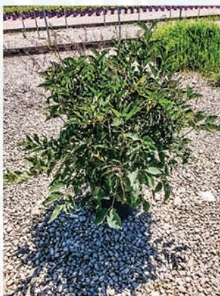
SYRINGA PATULA ' MISS KIM' MISS KIM LILAC

Height: 4 - 5', Foliage: Dark green, Spread: 5 - 7', Fall Foliage: Yellow, Zone: 3 - 7, Shape: Broad, round