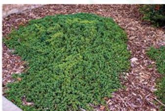
JUNIPERUS PROCUMBENS 'NANA' DWARF JAPANESE GARDEN JUNIPER

Height: 4 - 8", Foliage: Blue-green, Spread: 6 - 8', Fall Foliage: Purple, Zone: 3 - 9, Shape: Spreading