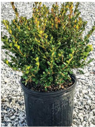
BUXUS MICROPHYLLA 'WINTER GEM' WINTER GEM BOXWOOD

Similar to 'Wintergreen' although may have a slightly richer color.