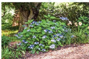
HYDRANGEA MACROPHYLLA 'TWIST-N-SHOUT' TWIST-N-SHOUT HYDRANGEA

Height: 4 - 6', Foliage: Green, Spread: 4 - 5', Fall Foliage: Burgundy, Zone: 5 - 9, Shape: Upright, round