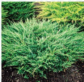
JUNIPERUS HORIZONTALIS PLUMOSA 'YOUNGSTOWN' COMPACT ANDORRA JUNIPER

Height: 12 - 15", Foliage: Blue-gray, Spread: 6 - 8', Fall Foliage: Purple, Zone: 3 - 9, Shape: Spreading