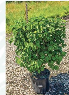
VIBURNUM DENTATUM ARROWWOOD VIBURNUM

Height: 4 - 8', Foliage: Green, Spread: 4 - 8', Fall Foliage: Red, Zone: 4 - 7, Shape: Round