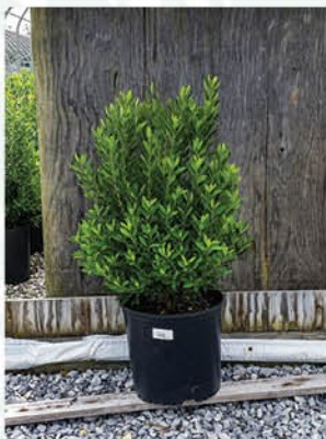
ILEX GLABRA 'SHAMROCK' SHAMROCK COMPACT INKBERRY

Height: 8 - 10', Foliage: Green, Spread: 6 - 8', Fall Foliage: Green, Zone: 4 - 9, Shape: Oval, round