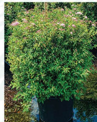
SPIRAEA JAPONICA 'SHIROBANA' SHIROBANA SPIREA

Height: 3 - 4', Foliage: Green, Spread: 3 - 4', Fall Foliage: Yellow, Zone: 4 - 8, Shape: Round