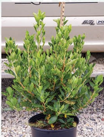
CLETHRA ALNIFOLIA 'HUMMINGBIRD' HUMMINGBIRD SUMMERSWEET

Height: 4 - 8', Foliage: Green, Spread: 4 - 6', Fall Foliage: Yellow, Zone: 4 - 9, Shape: Upright