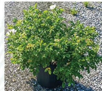
ROSA RUGOSA 'ALBA' WHITE RUGOSA ROSE

Height: 4 - 6', Foliage: Green, Spread: 4 - 6', Fall Foliage: Orange-red, Zone: 2 - 7, Shape: Upright