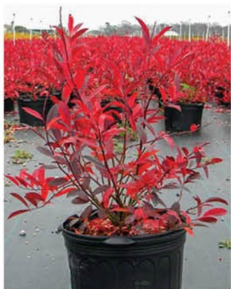
ITEA VIRGINICA 'MERLOT' MERLOT VIRGINIA SWEETSPIRE

Introduced for a more compact, more intense red Fall color. Ideal replacement for Little Henry Itea.