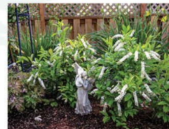
ITEA VIRGINICA 'HENRY'S GARNET' HENRY'S GARNET VIRGINIA SWEETSPIRE

Height: 6 - 9', Foliage: Dark green, Spread: 6 - 8', Fall Foliage: Rich orange, Zone: 4 - 9, Shape: Upright, round