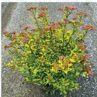
SPIRAEA JAPONICA 'FIRELIGHT' FIRELIGHT SPIREA

Height: 3 - 4', Foliage: Yellow, Spread: 3 - 4', Fall Foliage: Yellow, Zone: 3 - 8, Shape: Round