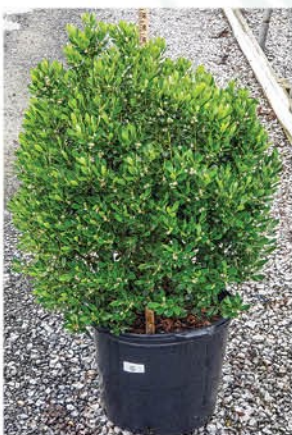
ILEX GLABRA 'DENSA' DENSA INKBERRY

Height: 4 - 6', Foliage: Glossy green, Spread: 6 - 8', Fall Foliage: Green, Zone: 4 - 9, Shape: Round