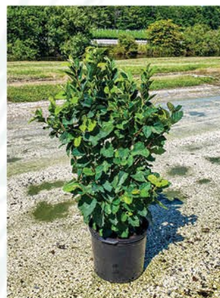
HAMAMELIS VERNALIS VERNAL WITCHHAZEL

Height: 5 - 6', Foliage: Textured rich blue-green, Spread: 5 - 6', Fall Foliage: Yellow-orange, Zone: 5 - 8, Shape: Upright