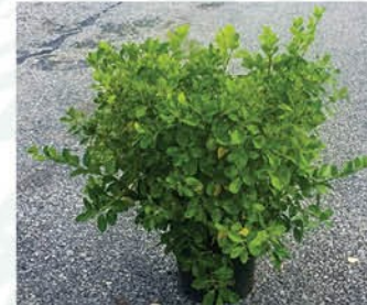
EUONYMUS KIAUTSCHOVICUS 'MANHATTAN' MANHATTAN EUONYMUS

Height: 6 - 8', Foliage: Green, Spread: 6 - 8', Fall Foliage: Crimson, Zone: 5 - 8, Shape: Round