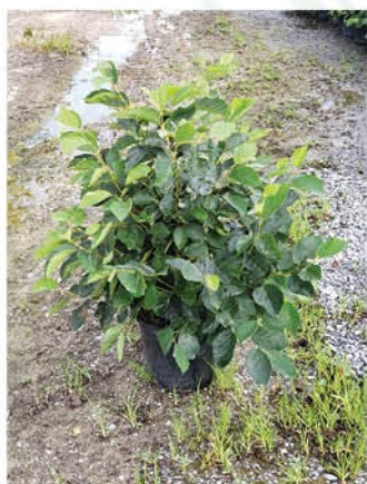
HAMAMELIS VIRGINIANA COMMON WITCHHAZEL

Height: 10 - 15', Foliage: Textured green, Spread: 10 - 12', Fall Foliage: Gold, Zone: 4 - 8, Shape: Round