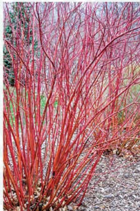
CORNUS SERICEA BAILEYII BAILEY RED TWIG DOGWOOD

Height: 10 - 15', Foliage: Green, Spread: 10 - 15', Fall Foliage: Purple, Zone: 4 - 8, Shape: Upright, round