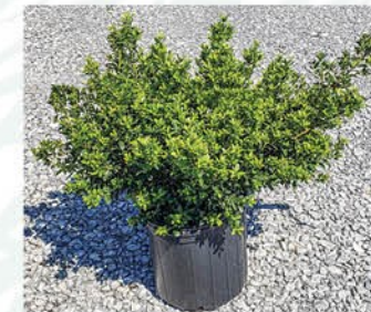
ILEX CRENATA 'HOOGENDORN' HOOGENDORN JAPANESE HOLLY

Height: 3', Foliage: Dull green, Spread: 4', Fall Foliage: N/A, Zone: 5 - 8, Shape: Mound