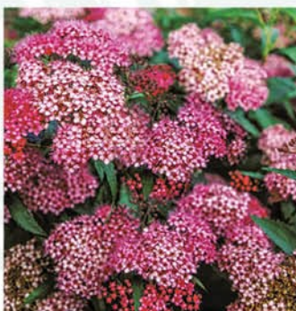
SPIRAEA JAPONICA 'NEON FLASH' NEON FLASH SPIREA

Height: 2 - 3', Foliage: Green, Spread: 2 - 3', Fall Foliage: Yellow- brown, Zone: 4 - 8, Shape: Round