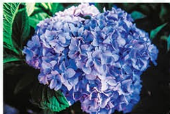
HYDRANGEA MACROPHYLLA 'NIKKO BLUE' NIKKO BLUE HYDRANGEA

Height: 3 - 5', Foliage: Green, Spread: 3 - 5', Fall Foliage: Bronze, Zone: 4 - 9, Shape: Round