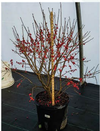
ILEX VERTICILLATA 'RED SPRITE' RED SPRITE WINTERBERRY

This slow growing, large persistent berried dwarf Holly is great in mass plantings and moist soils.