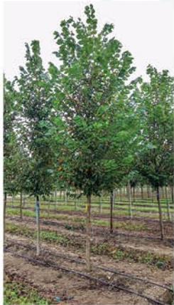
ULMUS AMERICANA 'JEFFERSON' JEFFERSON ELM

Height: 40 - 50', Foliage: Silver-green, Spread: 20 - 30', Fall Foliage: Yellow, Zone: 4 - 7, Shape: Pyramidal