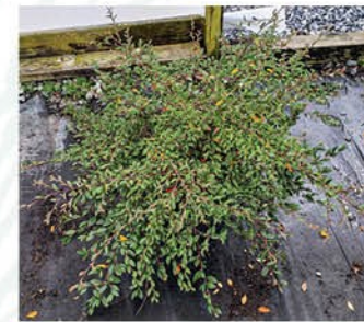
COTONEASTER SALICIFOLIUS 'REPANDENS' WILLOWLEAF COTONEASTER

Height: 1 - 2', Foliage: Rich green, Spread: 4 - 6', Fall Foliage: Red-purple, Zone: 5 - 7, Shape: Prostrate