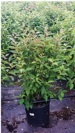
CORNUS RACEMOSA GRAY DOGWOOD

Height: 6 - 10', Foliage: Green, Spread: 6 - 10', Fall Foliage: Purple, Zone: 4 - 8, Shape: Round