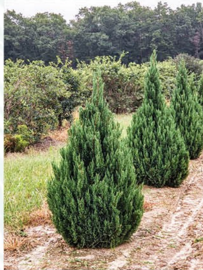
JUNIPERUS CHINENSIS 'BLUE POINT' BLUE POINT JUNIPER

Height: 30 - 60', Foliage: Green, Spread: 15 - 25', Fall Foliage: Green, Zone: 5 - 9, Shape: Pyramidal