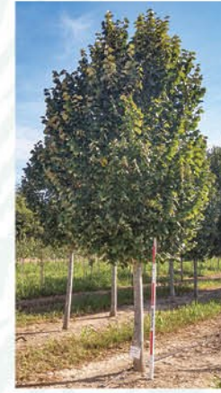
TILIA TOMENTOSA 'STERLING SILVER' STERLING SILVER LINDEN

Height: 40 - 60', Foliage: Silver-green, Spread: 25 - 30' Fall Foliage: Yellow, Zone: 4 - 7, Shape: Pyramidal