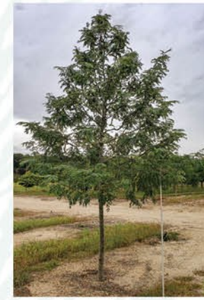
GLEDITSIA TRIACANTHOS INERMIS 'HALKA' HALKA LOCUST

Height: 30 - 40', Foliage: Green, Spread: 30 - 40', Fall Foliage: Yellow, Zone: 4 - 9, Shape: Round