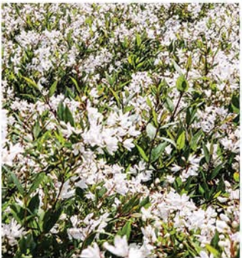
DEUTZIA GRACILIS 'NIKKO' NIKKO DEUTZIA

Height: 4 - 5', Foliage: Dark green, Spread: 6 - 8', Fall Foliage: Red-purple, Zone: 6 - 8, Shape: Spreading, pendulous