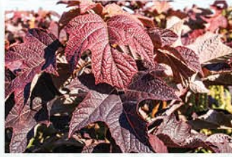
HYDRANGEA QUERCIFOLIA 'SNOW QUEEN' SNOW QUEEN HYDRANGEA

Height: 4 - 6', Foliage: Coarse green, Spread: 3 - 5', Fall Foliage: Red-orange, Zone: 5 - 9, Shape: Upright