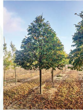
ULMUS WILSONIANA 'PROSPECTOR' PROSPECTOR ELM

Height: 60 - 80', Foliage: Green, Spread: 50 - 60', Fall Foliage: Yellow, Zone: 4 - 9, Shape: Upright