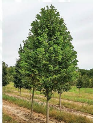
ULMUS AMERICANA 'PRINCETON' PRINCETON AMERICAN ELM

Height: 60 - 70', Foliage: Green, Spread: 40 - 50', Fall Foliage: Yellow, Zone: 4 - 9, Shape: Vase