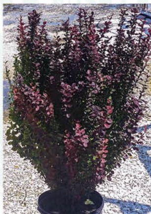
BERBERIS THUNBERGII ATROPURPUREA 'MARSHALL'S UPRIGHT' MARSHALL'S UPRIGHT BARBERRY

Height: 2', Foliage: Burgundy, Spread: 2 - 3', Fall Foliage: Purple-red, Zone: 4 - 7, Shape: Compact, round