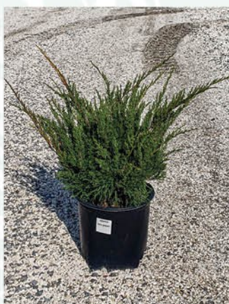
JUNIPERUS CHINENSIS 'SEA GREEN' SEA GREEN JUNIPER

Height: 2 - 4', Foliage: Rich green, Spread: 5 - 8', Fall Foliage: Green, Zone: 4 - 9, Shape: Spreading