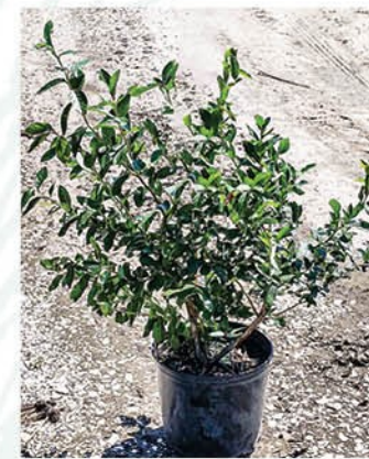
VACCINIUM X BLUE CROP BLUE CROP BLUEBERRY

Height: 4 - 6', Foliage: Green, Spread: 4 - 6', Fall Foliage: Orange- scarlet, Zone: 3 - 6, Shape: Upright Height: 3', Foliage: Green, Spread: 3', Fall Foliage: Red, Zone: 2 - 6, Shape: Low, spreading