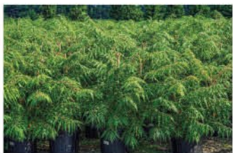
RHUS TYPHINA STAGHORN SUMAC

Similar to Smooth Sumac, Staghorn has a velvety coat of short brown hairs like the antlers of a deer.