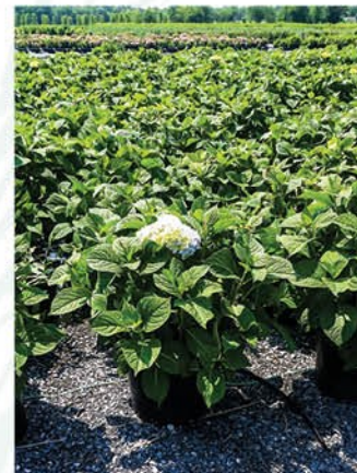
HYDRANGEA MACROPHYLLA 'PENNY MAC' PENNY MAC HYDRANGEA

Height: 4 - 5', Foliage: Glossy green, Spread: 4 - 5', Fall Foliage: Yellow, Zone: 5 - 9, Shape: Round