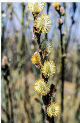
SALIX DISCOLOR PUSSY WILLOW

Height: 4 - 6', Foliage: Green, Spread: 4 - 6', Fall Foliage: Red-purple Zone: 3 - 7, Shape: Round