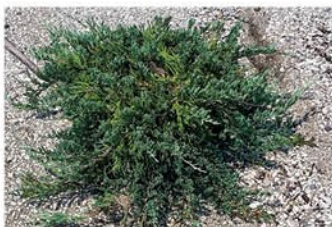
JUNIPERUS HORIZONTALIS 'BAR HARBOR' BAR HARBOR JUNIPER

This prostrate evergreen groundcover adds interesting texture to the landscape while tolerating salty conditions.