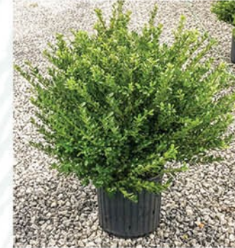
ILEX CRENATA 'COMPACTA' COMPACT JAPANESE HOLLY

Height: 4 - 6', Foliage: Coarse green, Spread: 3 - 5', Fall Foliage: Red-bronze, Zone: 5 - 9, Shape: Upright