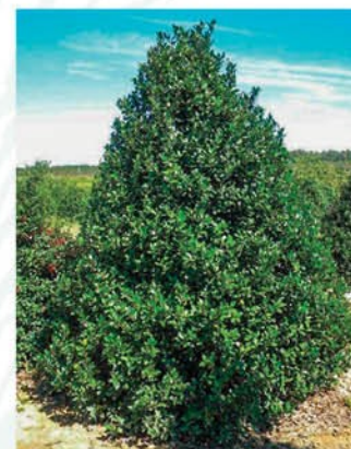
ILEX X MESERVEAE 'BLUE PRINCESS' BLUE PRINCESS HOLLY

Height: 10 - 12', Foliage: Blue-green, Spread: 6 - 8', Fall Foliage: Green, Zone: 5 - 9, Shape: Pyramidal