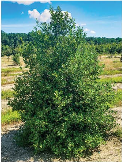
ILEX OPACA AMERICAN HOLLY

A native evergreen with stiff branches and spiny, leathery leaves, produces bright red berries in the Winter.