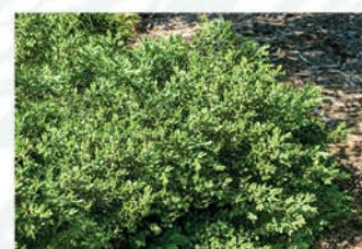
BUXUS 'GREEN VELVET' GREEN VELVET BOXWOOD

Height: 3 - 5', Foliage: Green, Spread: 3 - 4', Fall Foliage: Green, Zone: 5 - 8, Shape: Oval, pyramidal