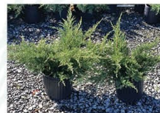
JUNIPERUS CHINENSIS 'PFITZERIANA COMPACTA' COMPACT PFITZER JUNIPER

Height: 3 - 4', Foliage: Green w/ Yellow, Spread: 3 - 5', Fall Foliage: N/A, Zone: 4 - 9, Shape: Spreading