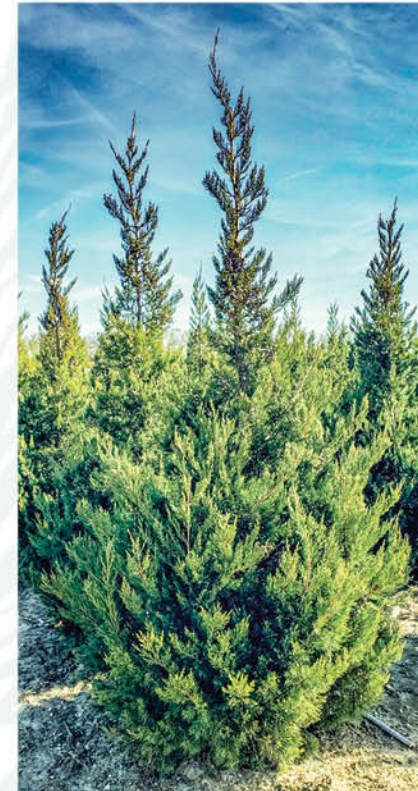
JUNIPERUS CHINENSIS 'HETZL COLUMNARIS' HETZL COLUMNARIS CHINESE JUNIPER

Height: 10 - 14', Foliage: Blue-green, Spread: 4 - 8', Fall Foliage: Blue-green, Zone: 4 - 9, Shape: Upright, pyramidal