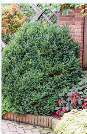
BUXUS X 'GREEN MOUNTAIN' GREEN MOUNTAIN BOXWOOD

Height: 10 - 15', Foliage: Green, Spread: 2 - 10', Fall Foliage: Green, Zone: 5 - 9, Shape: Spreading