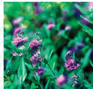
CARYOPTERIS X CLANDONENSIS BLUE MIST SPIREA

Height: 3 - 5', Foliage: Green, Spread: 3 - 5', Fall Foliage: Green-bronze, Zone: 6 - 9, Shape: Round