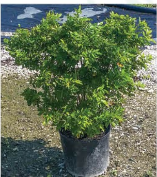
ROSA VIRGINIANA VIRGINIA ROSE

Height: 4 - 6', Foliage: Green, Spread: 4 - 6', Fall Foliage: Orange-scarlet, Zone: 2 - 7, Shape: Upright