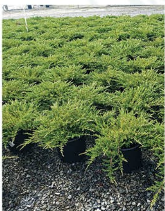
JUNIPERUS CHINENSIS SARGENTII 'VIRIDIS' SARGENT GREEN JUNIPER

Height: 2 - 3', Foliage: Gray green, Spread: 4 - 6', Fall Foliage: N/A, Zone: 3 - 9, Shape: Spreading