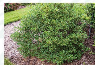
ILEX VERTICILLATA 'JIM DANDY' JIM DANDY WINTERBERRY

Height: 10 - 12', Foliage: Blue-green, Spread: 7 - 9', Fall Foliage: Green, Zone: 5 - 9, Shape: Round