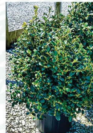
ILEX MESOG 'CHINA BOY' CHINA BOY HOLLY

Height: 3 - 4', Foliage: Green, Spread: 3 - 4', Fall Foliage: Green, Zone: 4 - 9, Shape: Round, upright