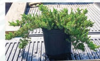
JUNIPERUS CONFERTA 'BLUE PACIFIC' BLUE PACIFIC JUNIPER

Height: 4 - 6', Foliage: Green, Spread: 4 - 6', Fall Foliage: Green, Zone: 4 - 8, Shape: Spreading