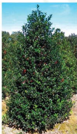
ILEX X MESERVEAE 'BLUE PRINCESS' BLUE PRINCESS HOLLY

Height: 10 - 12', Foliage: Blue-green, Spread: 6 - 8', Fall Foliage: Green, Zone: 5 - 9, Shape: Round