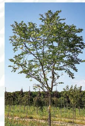
GYMNOCLADUS DIOCUS KENTUCKY COFFEETREE

Height: 40-45', Foliage: Green, Spread: 20', Fall Foliage: Yellow, Zone: 4 - 9, Shape: Upright, pyramidal