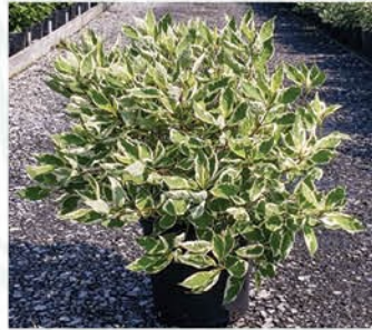
CORNUS ALBA 'ARGENTEO-MARGINATA' VARIEGATED DOGWOOD

Height: 3 - 4', Foliage: Green, Spread: 3 - 4', Fall Foliage: Yellow, Zone: 3 - 7, Shape: Upright