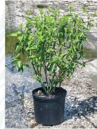
CORNUS AMOMUM SILKY DOGWOOD

Height: 6 - 8', Foliage: Variegated cream and green, Spread: 4 - 5', Fall Foliage: Red-purple, Zone: 2 - 7, Shape: Erect, round