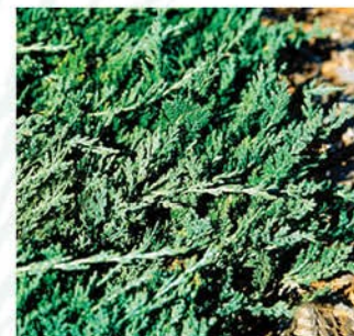
JUNIPERUS HORIZONTALIS 'WILTONI' BLUE RUG JUNIPER

Height: 15 - 18", Foliage: Green, Spread: 4 - 6', Fall Foliage: Bronze, Zone: 3 - 9, Shape: Spreading