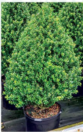
ILEX CRENATA 'STEED'S' STEED'S UPRIGHT HOLLY

Height: 6 - 8', Foliage: Glossy green, Spread: 12", Fall Foliage: N/A, Zone: 5 - 8, Shape: Extremely fastigate