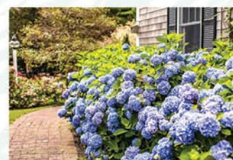
HYDRANGEA MACROPHYLLA 'ALL SUMMER BEAUTY' ALL SUMMER BEAUTY HYDRANGEA

Height: 4', Foliage: Smooth with silvery undersides, Spread: 8', Fall Foliage: Yellow, Zone: 4 - 8, Shape: Spreading