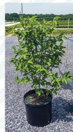
LINDERA BENZOIN SPICEBUSH

Height: 10 - 15', Foliage: Green, Spread: 8 - 10', Fall Foliage: N/A, Zone: 5 - 7, Shape: Upright