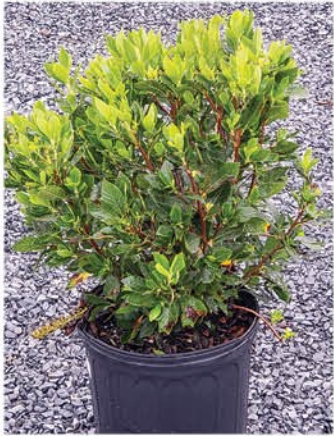
CLETHRA ALNIFOLIA 'SIXTEEN CANDLES' SIXTEEN CANDLES CLETHRA

A vigorous cultivar boasting large 4-6" persistent fragrant white flowers.