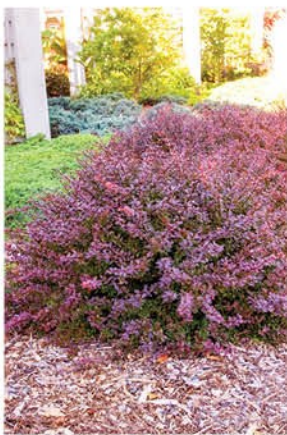
BERBERIS THUNBERGII ATROPURPUREA 'CRIMSON PYGMY' CRIMSON PYGMY BARBERRY

A fantastic selection to create a low growing, colorful hedge.