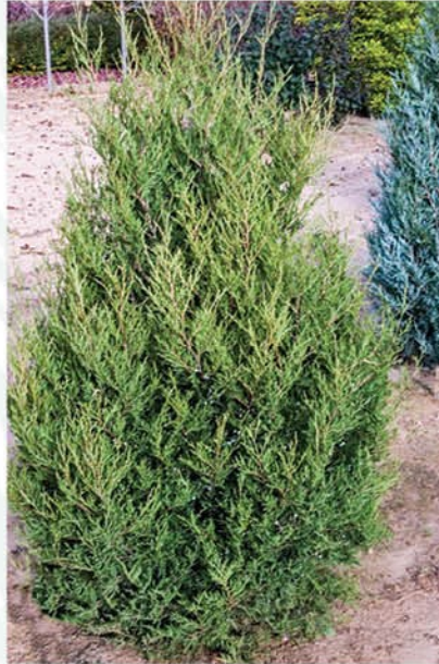
JUNIPERUS CHINENSIS 'SPARTAN' SPARTAN JUNIPER

Height: 12 - 15', Foliage: Green w/ Yellow, Spread: 6 - 8', Fall Foliage: N/A, Zone: 4 - 9, Shape: Irregular