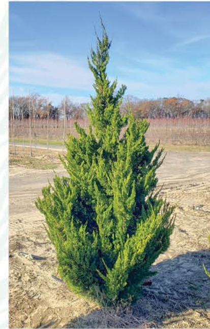
JUNIPERUS CHINENSIS 'TORULOSA' HOLLYWOOD JUNIPER

Height: 15 - 20', Foliage: Green, Spread: 6 - 8', Fall Foliage: Green, Zone: 3 - 9, Shape: Pyramidal