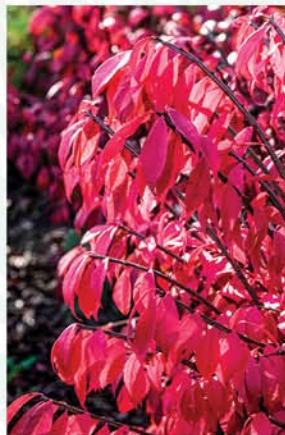
EUONYMUS ALATUS COMPACTUS DWARF BURNING BUSH

Height: 1 - 2', Foliage: Green, Spread: 2 - 5', Fall Foliage: Yellow, Zone: 5 - 8, Shape: Round