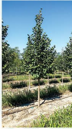
TILIA TOMENTOSA 'GREEN MOUNTAIN' GREEN MOUNTAIN SILVER LINDEN

Height: 40 - 50', Foliage: Green, Spread: 30 - 40', Fall Foliage: Yellow, Zone: 3 - 7, Shape: Oval