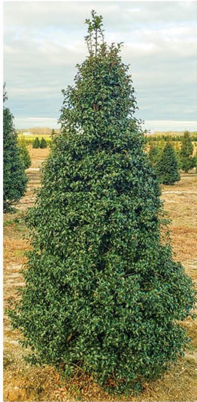
ILEX AQUIPERNYI 'DRAGON LADY' DRAGON LADY HOLLY

A strong pyramidal growth habit makes this plant very versatile.