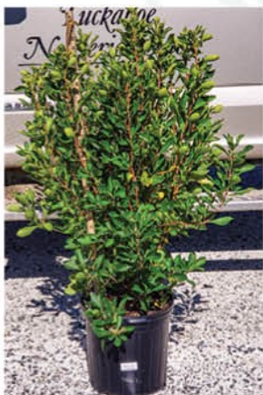
CLETHRA ALNIFOLIA SUMMERSWEET

Height: 2 - 3', Foliage: Silver, Spread: 2 - 3', Fall Foliage: Brown, Zone: 6 - 9, Shape: Round