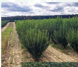
LIGUSTRUM OVALIFOLIUM 'CALIFORNIA PRIVET' CALIFORNIA PRIVET

Height: 15 - 18", Foliage: Lime-green, Spread: 8 - 10', Fall Foliage: Purple, Zone: 3 - 9, Shape: Spreading