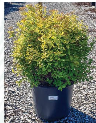
SPIRAEA JAPONICA 'GOLDMOUND' GOLDMOUND SPIREA

Height: 2 - 3', Foliage: Orange-yellow, Spread: 2 - 3', Fall Foliage: Orange-red, Zone: 3 - 8, Shape: Round