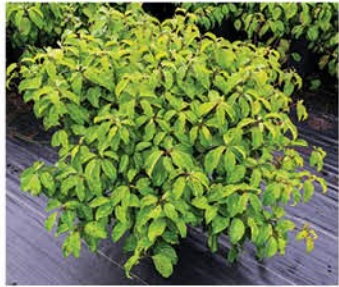
CORNUS SERICEA 'KELSEY'S DWARF' KELSEY'S DWARF RED TWIG DOGWOOD

Bright red stems in the Winter and abundant white flowers in the Spring.