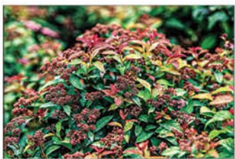
SPIRAEA X BUMALDA 'GOLDFLAME' GOLDFLAME SPIREA

Beautiful bronze-red foliage turning soft yellow. Wonderful pink flowers, good heat tolerance and leaf color make this an ideal selection.