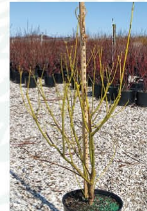
CORNUS SERICEA 'BUD'S YELLOW' BUD'S YELLOW TWIG DOGWOOD

Height: 6 - 9', Foliage: Green, Spread: 6 - 9', Fall Foliage: Red-purple, Zone: 2 - 6, Shape: Spreading, round