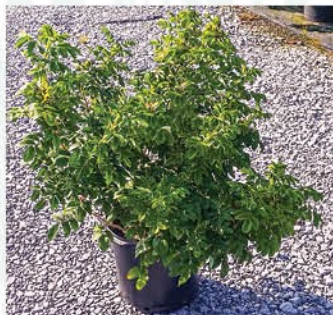
ROSA RUGOSA RUGOSA ROSE

Height: 15 - 25', Foliage: Green, Spread: 15 - 25', Fall Foliage: Yellow to Red, Zone: 4 - 8, hape: Round