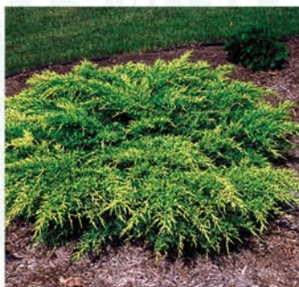
JUNIPERUS CHINENSIS 'OLD GOLD' OLD GOLD JUNIPER

Height: 3', Foliage: Green, Spread: 3', Fall Foliage: Red, Zone: 5 - 9, Shape: Round