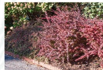
BERBERIS THUNBERGII ATROPURPUREA 'ROSE GLOW' ROSY GLOW BARBERRY

Height: 3 - 6', Foliage: Burgundy, Spread: 4 - 7', Fall Foliage: Purple-red, Zone: 4 - 7, Shape: Upright