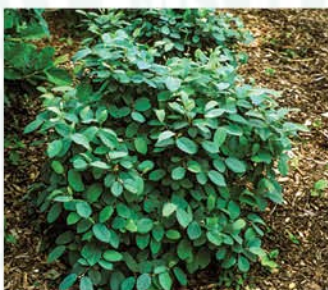
FOTHERGILLA GARDENII 'MOUNT AIRY' MOUNT AIRY DWARF FOTHERGILLA

Height: 8 - 10', Foliage: Glossy green, Spread: 6 - 8', Fall Foliage: Yellow, Zone: 6 - 8, Shape: Upright, spreading