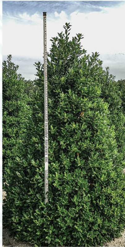
ILEX 'NELLIE R. STEVENS' NELLIE R. STEVENS HOLLY

Height: 15 - 20', Foliage: Glossy green, Spread: 4 - 6', Fall Foliage: Green, Zone: 5 - 8, Shape: Pyramidal