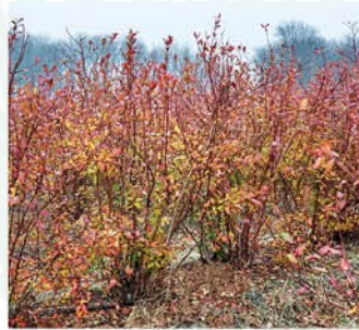
VACCINIUM CORYMBOSUM Highbush Blueberry

Grows well in acidic, poor soils. Edible berries.