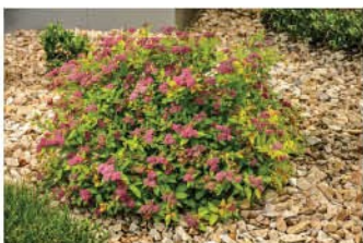
SPIRAEA JAPONICA 'WALBUMA' MAGIC CARPET SPIREA

A compact grower with brilliant red foliage with beautiful pink flowers.