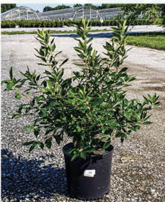
ILEX VERTICILLATA 'WINTER RED' WINTER RED WINTERBERRY

Height: 5 - 8', Foliage: Dark green, Spread: 5 - 8', Fall Foliage: Yellow, Zone: 3 - 9, Shape: Upright, round