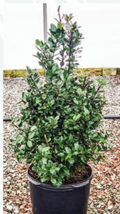
ILEX X MESERVEAE 'BLUE STALLION' BLUE STALLION HOLLY

Height: 10 - 12', Foliage: Blue-green, Spread: 7 - 9', Fall Foliage: Green, Zone: 5 - 9, Shape: Round