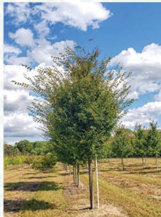
ZELKOVA SERRATA 'GREEN VASE' GREEN VASE ZELKOVA

Height: 30 - 40', Foliage: Green, Spread: 20 - 30', Fall Foliage: Yellow Zone: 4 - 9, Shape: Vase