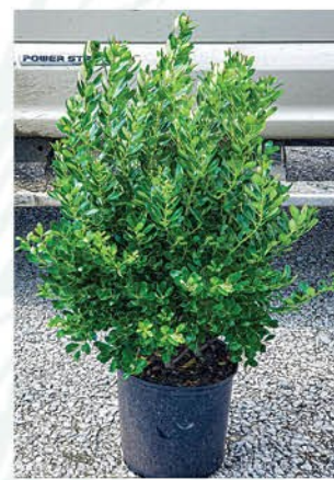
ILEX GLABRA COMPACTA COMPACT INKBERRY

Height: 6 - 8', Foliage: Glossy green, Spread: 4 - 6', Fall Foliage: N/A, Zone: 5 - 8, Shape: Pyramidal