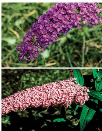
BUDDLEIA DAVIDII BUTTERFLY BUSH

Height: 3 - 4', Foliage: Rosy red, Spread: 2 - 3', Fall Foliage: Maroon, Zone: 4 - 7, Shape: Round, open