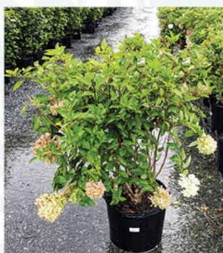
HYDRANGEA PANICULATA 'COMPACT' COMPACT PEE GEE HYDRANGEA

Height: 3 - 5', Foliage: Green, Spread: 3 - 5', Fall Foliage: Burgundy, Zone: 4 - 9, Shape: Upright, round