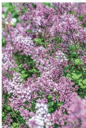
SYRINGA MEYERI DWARF KOREAN LILAC

Height: 6 - 8', Foliage: Blue-green, Spread: 10 - 12', Fall Foliage: Yellow, Zone: 3 - 8, Shape: Mound, descending