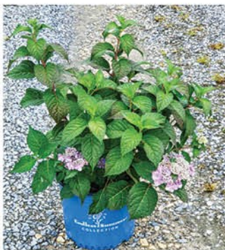
HYDRANGEA MACROPHYLLA 'ENDLESS SUMMER' ENDLESS SUMMER HYDRANGEA

Blooming off new and old wood, this Hydrangea will give you large blooms all season long.