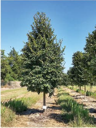
ULMUS CARPINIFOLIA 'ACCOLADE' ACCOLADE SMOOTHLEAF ELM

A great substitution to the American Elm. Rich green leaves with profound disease and insect resistance.