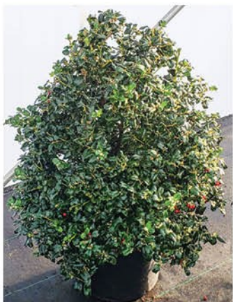
ILEX MESOG 'CHINA GIRL' CHINA GIRL HOLLY

The female form with abundant red berries. More heat tolerant than other species.