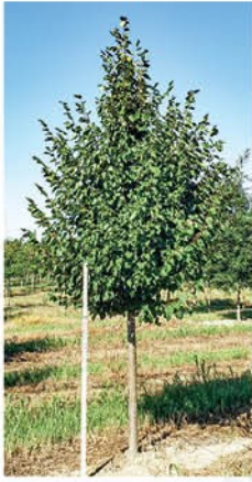
TILIA CORDATA 'GREENSPIRE' GREENSPIRE LINDEN

Widely used street tree which withstands difficult soil conditions. Fragrant yellow flowers.