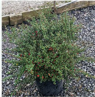
COTONEASTER DAMMERI 'CORAL BEAUTY' CORAL BEAUTY COTONEASTER

Height: 2 - 3', Foliage: Green, Spread: 2 - 3', Fall Foliage: Yellow, Zone: 5 - 7, Shape: Compact