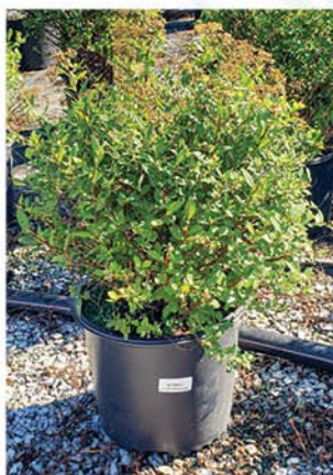
SPIRAEA JAPONICA 'LITTLE PRINCESS' LITTLE PRINCESS SPIREA

Height: 2 - 3', Foliage: Gold-green, Spread: 2 - 3', Fall Foliage: Bronze, Zone: 3 - 8, Shape: Round