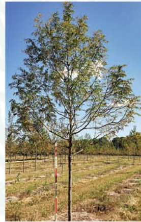
GLEDITSIA TRIACANTHOS INERMIS STREET KEEPER LOCUST

Height: 45', Foliage: Green, Spread: 30', Fall Foliage: Yellow, Zone: 4 - 9, Shape: Ascending, pyramidal