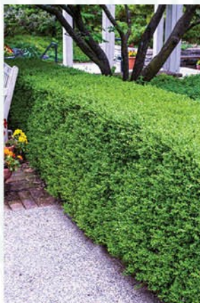
BUXUS MICROPHYLLA 'WINTERGREEN' WINTER GREEN BOXWOOD

Height: 2', Foliage: Green, Spread: 2', Fall Foliage: Green, Zone: 6 - 9, Shape: Round