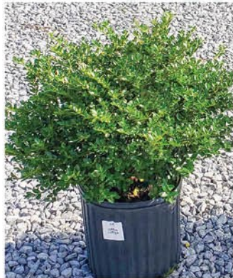
ILEX CRENATA 'GREEN LUSTRE' GREEN LUSTER JAPANESE HOLLY

Height: 6 - 7', Foliage: Glossy green, Spread: 6 - 8', Fall Foliage: N/A, Zone: 6 - 8, Shape: Compact, spreading