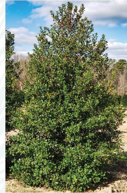
ILEX OPACA 'GREENLEAF' GREENLEAF AMERICAN HOLLY

Height: 15 - 25', Foliage: Glossy green, Spread: 15 - 20', Fall Foliage: Green, Zone: 6 - 9, Shape: Pyramidal