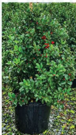
ILEX X MESERVEAE 'BLUE MAID' BLUE MAID HOLLY

Height: 3 - 5', Foliage: Glossy green, Spread: 3 - 5', Fall Foliage: Green, Zone: 5 - 8, Shape: Compact, round