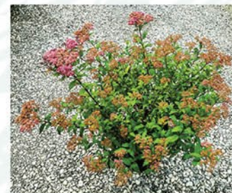
SPIRAEA X BUMALDA 'ANTHONY WATERER' ANTHONY WATERER SPIREA

Height: 30', Foliage: Green, Spread: 20', Fall Foliage: Yellow, Zone: 5 - 9, Shape: Upright