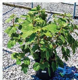
HYDRANGEA QUERCIFOLIA 'ALICE' ALICE HYDRANGEA

Height: 6', Foliage: Glossy green, Spread: 6', Fall Foliage: Orange-scarlet, Zone: 3 - 8, Shape: Round