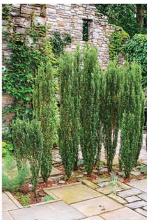
ILEX CRENATA 'SKY PENCIL' SKY PENCIL HOLLY

Dense upright habit covered with dark green leaves. Will create a nice hedge.