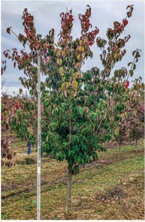
CORNUS 'RUTGAN' STELLAR PINK DOGWOOD

This is a rapid grower producing abundant soft pink blooms. Predominantly low branched with a strong vase shape habit. Great for mass plantings or specimen gardens.