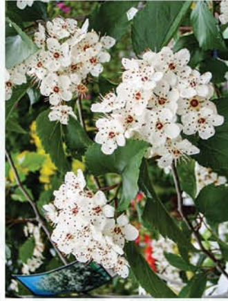
CRATAEGUS VIRIDIS 'WINTER KING' WINTER KING HAWTHORN

Height: 15 - 20', Foliage: Green, Spread: 20 - 30', Fall Foliage: Purple, Zone: 5 - 8, Shape: Round