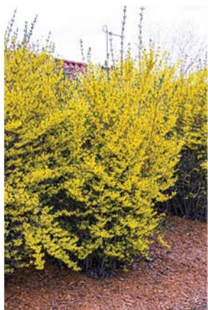
FORSYTHIA INTERMEDIA 'LYNWOOD GOLD' LYNWOOD GOLD FORSYTHIA

Brilliant yellow flowers in early April make this a favorite for borders or mass plantings.