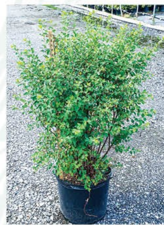
SPIRAEA X VANHOUTTEI VANHOUTTE SPIREA

Height: 3 - 5', Foliage: Blue-green, Spread: 3 - 4', Fall Foliage: Yellow, Zone: 3 - 8, Shape: Compact upright