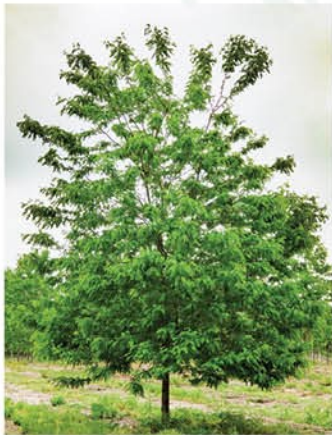
GLEDITSIA TRIACANTHOS INERMIS 'SKYLINE' SKYLINE LOCUST

Height: 30 - 40', Foliage: Green, Spread: 30 - 40', Fall Foliage: Yellow, Zone: 4 - 9, Shape: Round