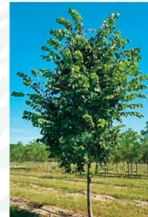
ULMUS AMERICANA 'VALLEY FORGE' VALLEY FORGE ELM

Height: 60 - 80', Foliage: Green, Spread: 30 - 40', Fall Foliage: Yellow, Zone: 3 - 9, Shape: Upright vase