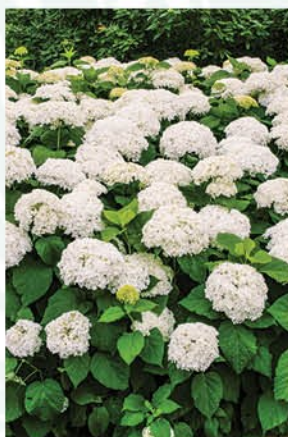
HYDRANGEA ARBORESCENS 'ANNABELLE' ANNABELLE HYDRANGEA

Height: 20 - 30', Foliage: Green, Spread: 20 - 25', Fall Foliage: Yellow, Zone: 3 - 8, Shape: Round