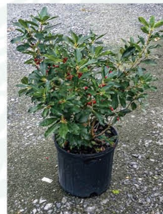
ILEX VERTICILLATA 'SPARKLEBERRY' SPARKLEBERRY WINTERBERRY

Height: 6 - 10', Foliage: Green, Spread: 6 - 10', Fall Foliage: Yellow, Zone: 3 - 9, Shape: Oval