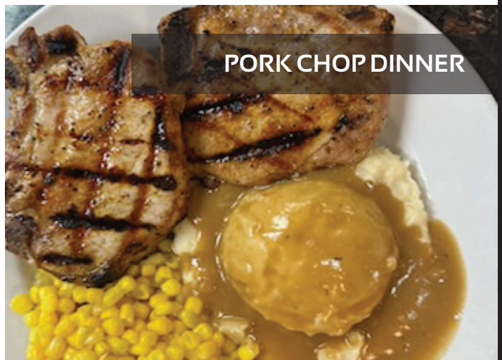
PORK CHOP DINNER