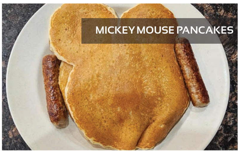
MICKEY MOUSE PANCAKES