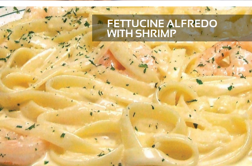
FETTUCINE ALFREDO WITH SHRIMP