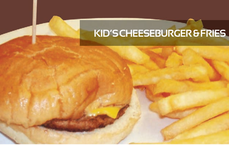
KID'S CHEESEBURGER & FRIES