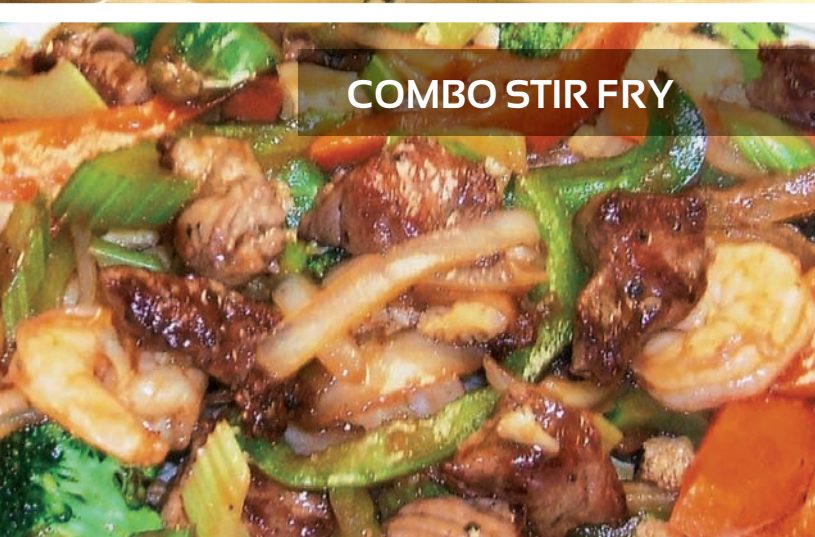
COMBO STIR FRY