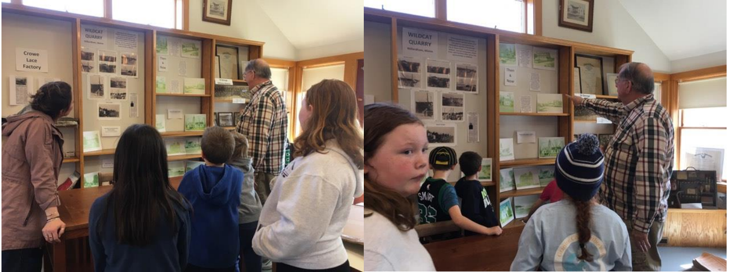
At the Old Library Museum checking out old pictures of the town – Then and Now!