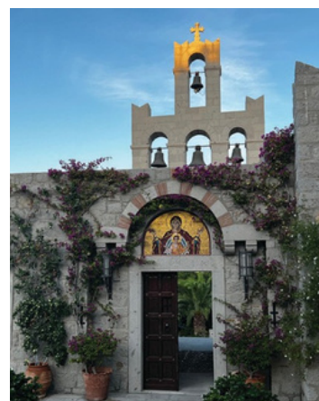
Evangelismos women's monastery

Share in daily gatherings • Pray in St. John's cave • Contemplative walking on ancient footpaths • Make a handmade prayer journal • Venerate relics on Leros Island • Fall in love with your prayer life • Small group of up to 20 pilgrims