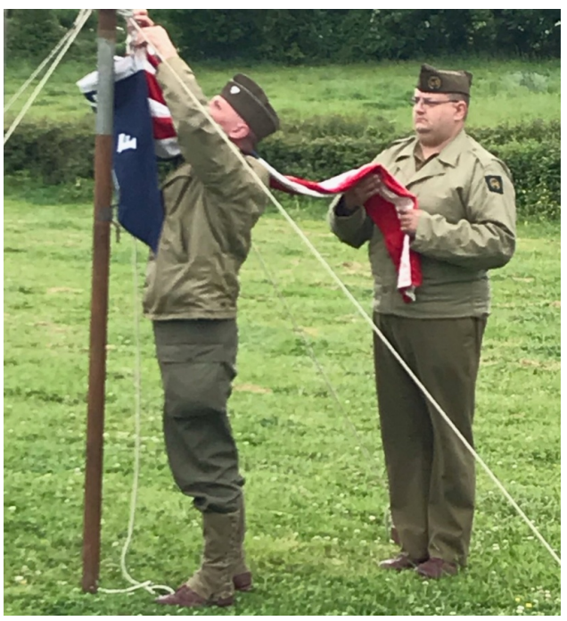
Raising the 48 Star American Flag

correct. They flew a 48 Star American Flag, which they treated with more reverence than many Americans presently treat our American Flag.