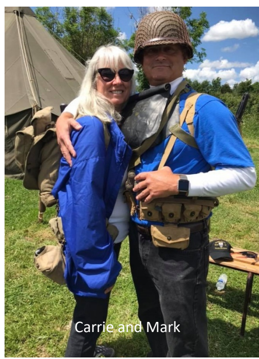
American Soldiers with French Girlfriends