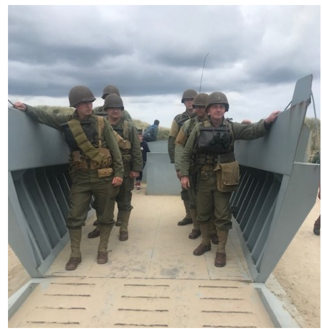
22<sup>nd</sup> IR France on Landing Craft