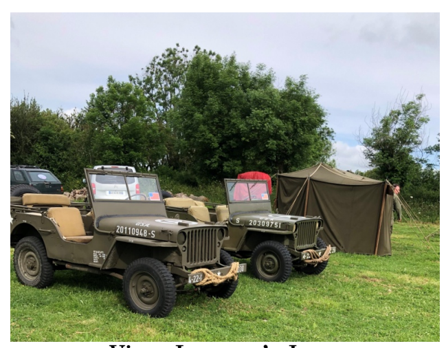
Vince Leveque's Jeep

The camp was located near the ocean and not far from Utah Beach. The UTM coordinates are 30U621223.73 E, 5480367.66N. A broader view will reveal how close to the ocean and Utah Beach the camp was located. It was time for introductions.