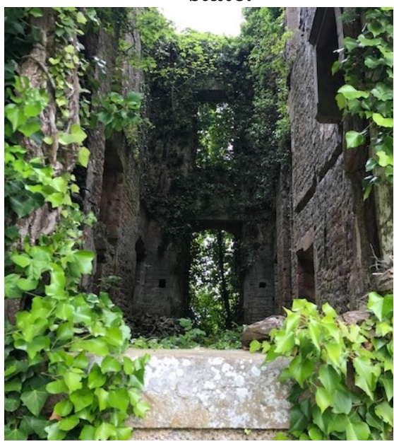
An examination of the granite window surrounds revealed many bullet strikes.

While we were at the Castle we were approached by two men, in Re-Enactor garb, informing us that we were on private property and had to leave. We made no argument and began to follow the men. I noticed that one of these men had a 4<sup>th</sup> ID Patch on his uniform. I told him that we were 4<sup>th</sup> ID. It was then that he noticed our 22<sup>nd</sup> hats and said that he identified with the 22<sup>nd</sup> IR and pointed out his historic vehicle lettered up in 22<sup>nd</sup>