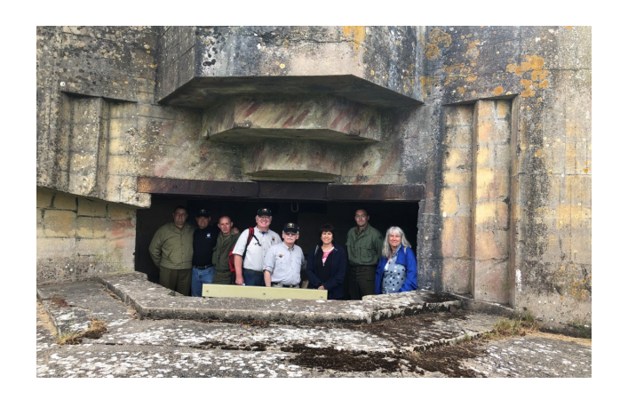
Azeville Bunker, Front of Main Gun Port