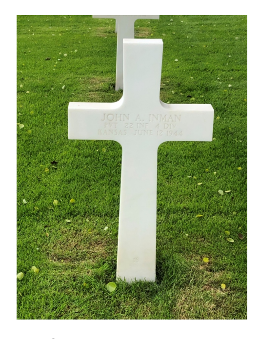
22<sup>nd</sup> Infantry Soldier Marker

We left the Cemetery and stopped in town for lunch. Our hosts had arranged for us to have a private tour the German Bunkers at Azeville. The 22<sup>nd</sup> IR had fought its way to this battery on June 7, 1944. It took days to reduce the battery at Azeville and its supporting battery at