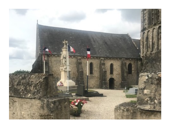
Church in Emondeville

The next morning found us in the village of Emondeville, which was about a ten minute drive from the rental house. I'm providing UTM coordinates so that the reader can see the quaintness of the area. Raising the 48 Star American Flag 30U619964.64 E, 5479812.15 N.