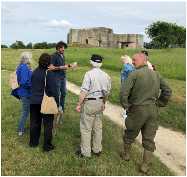
Private Tour of the Azeville Bunker Complex

Crisbecq. These shore defense batteries had been set up not only to defend against invasion from the sea, but from land. The accompanying photos will provide the best explanations as to what we saw. What the photos do not show is the interconnection between the fortifications along the Normandy Coast and how each of the major bunkers were protected by lesser bunkers. Fire Support Bases, FSB's, in Vietnam were set up so that they could provide mutual support in the event of attack. The idea may have come from the way the Germans had arranged their batteries.