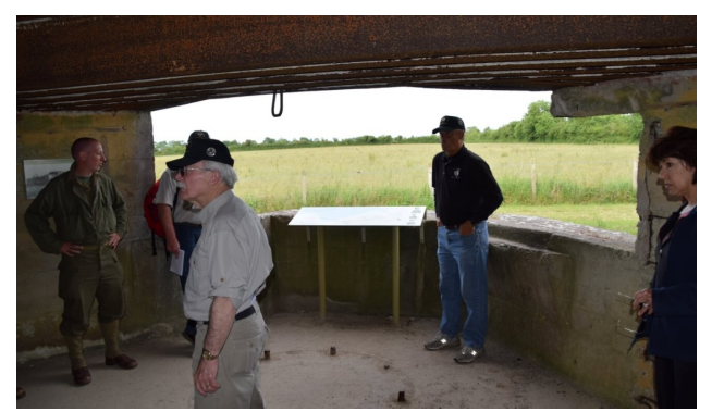
Azeville Bunker Main Gun Mount