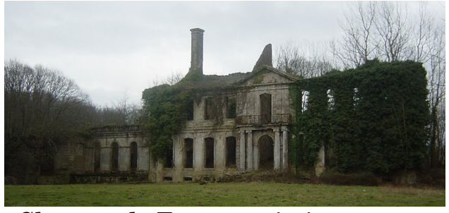
Chateau de Fontenay in its present state.

days attempts were made to drive the Germans from this granite structure, but none were successful. The Germans in the Castle, realizing that they were going to be surrounded, blew up the interior of the building as they made their escape to the east.