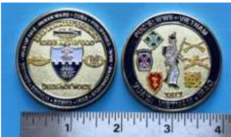
Challenge Coins One coin: $14.00. Shipping included Five Coins: $11.00 each +$5.00 Shipping 10 Coins: $10.00 each + $7.00 shipping 15 coins: $9.00 each + $10.00 Shipping 20 Coins: $8.00 each + $10.00 shipping