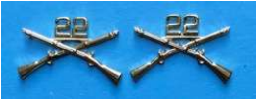
22nd Infantry Crossed Rifles: $14.00 per set Shipping: $3.00**