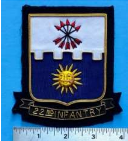
Blazer Patch: $10.00 Shipping: $3.00**