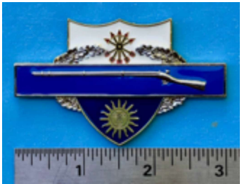
CIB/DUI: $12.00 Shipping : $3.00 **