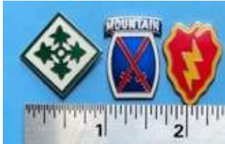
Divisional Pins Small $5.00 Large qw$7.00 Shipping is $3.00 per pin**