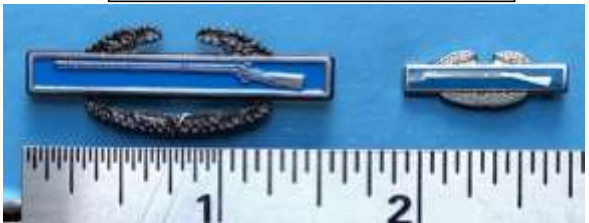
Mini CIB: $5.00. Midi CIB: $7.00 Shipping: $3.00 **