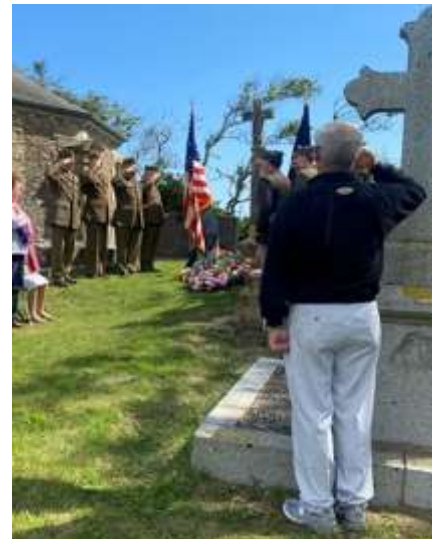
Our 22 nd Infantry France team reenacting different 22 nd Infantry battles in the Breakout Normandy.