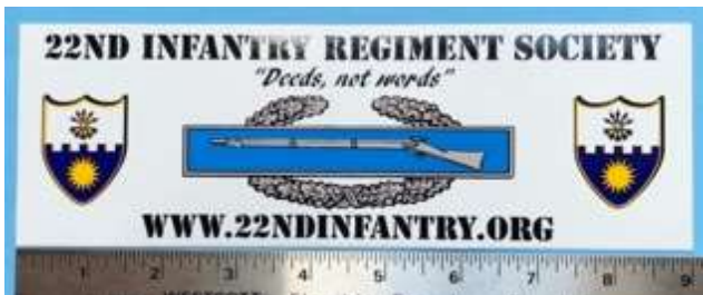
Bumper sticker $3.00