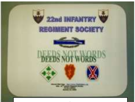
Mouse Pad: $5.00 Shipping: $3.00 **

**These item shipped without charge if ordered with hats or shirts.