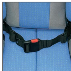
Lap belt IUS & XPS