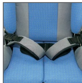
Groin strap IUS & XPS