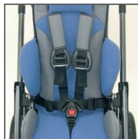
Five-point harness IUS only