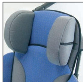
Headrest pads IUS only