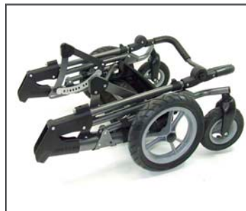
Compact folding size

The BINGO Evolution is the result our goal of continuous product development. The BINGO was good - we just made it better!