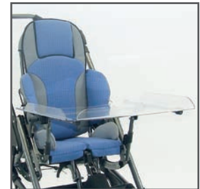
Therapy tray grey or clear IUS & XPS