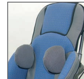
Lateral trunk supports IUS only