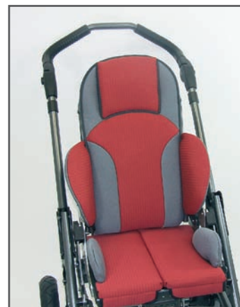
Upholstery colour: Red / Grey