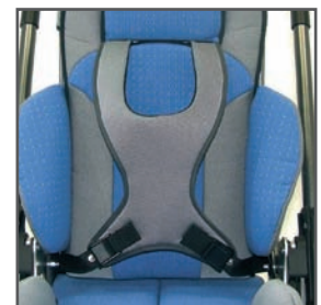
Chest-shoulder harness IUS only