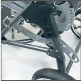
Bus Transport Package Standard (ISO 7176-19)