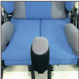
Abduction block IUS only