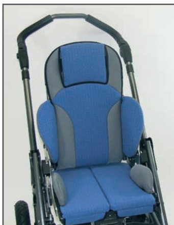
Upholstery colour: Blue / Grey