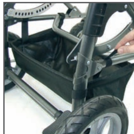
Soft Accessory Bag Standard (max. 3 kg)