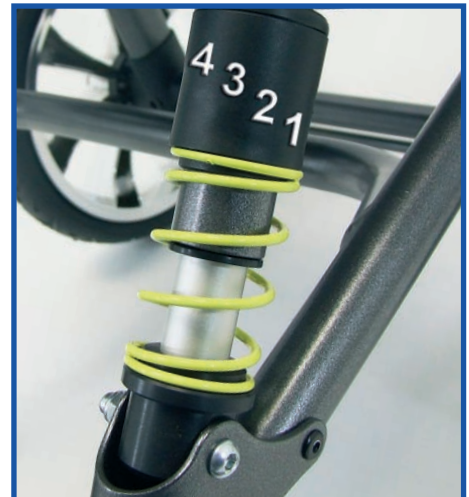
BINGO Evolution Adaptive Suspension System

HOGGI ® Partnering together to mobilise kids