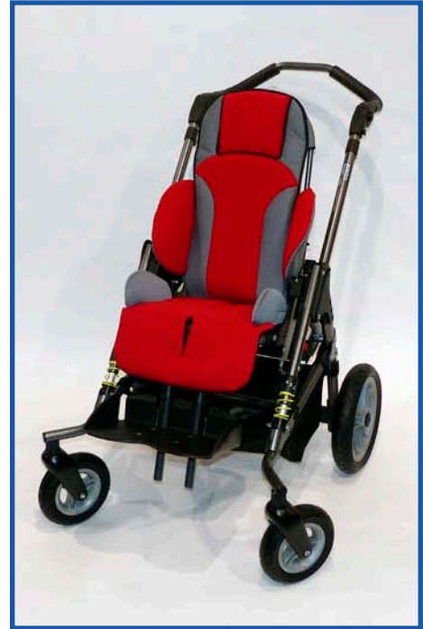
BINGO IUS Individual Upholstery System