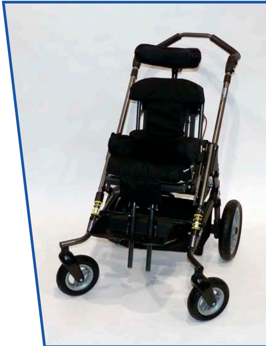
BINGO XPS Extra Positioning System