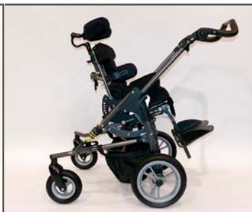
Seat in rear facing