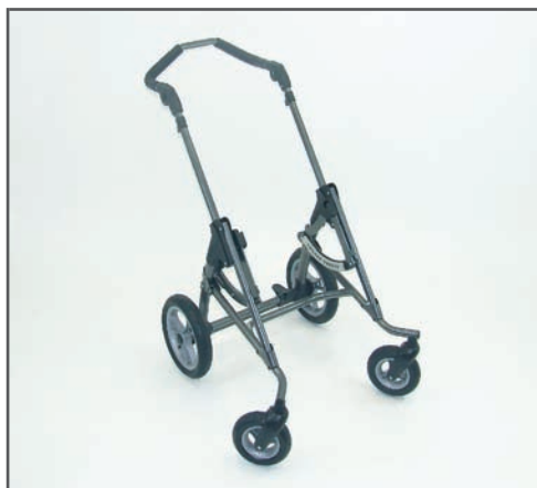
Frame colour: sparkling iron effect