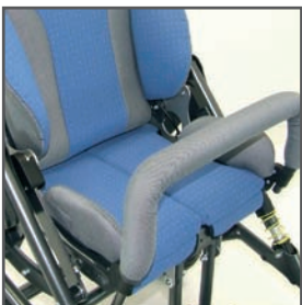
Grab rail with upholstery IUS & XPS