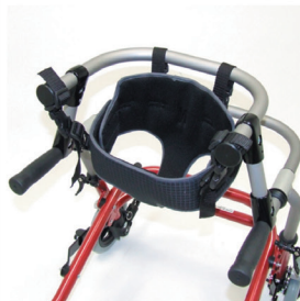
Sling Seat and Sling Seat Rail