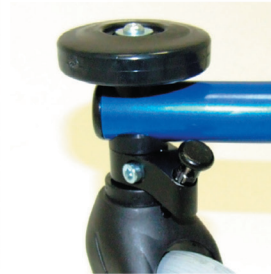
Bumper wheels and Swivel Wheel Lock