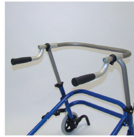
Grip Bar with Universal Grips