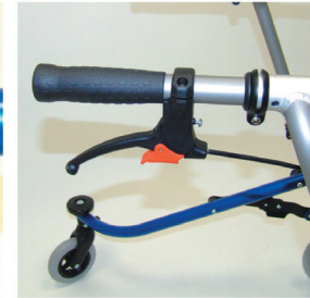
Driving Brake with Wheel Lock