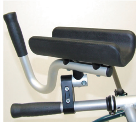
Forearm Supports with Upright Hand Grips (3 axle adjustment)