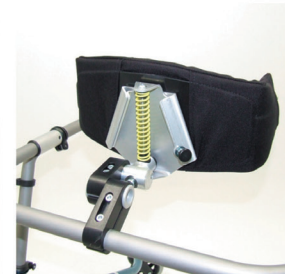
Dynamic Hip Control with Hip Belt

technical data Measures cm inches and weights kg lbs