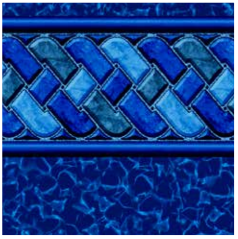
North Fork Creek Unibead 52", 54"