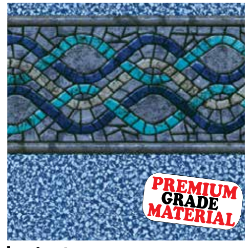
Lexington Unibead 48", 52", 54"