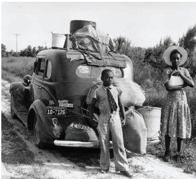
Photograph of a family leaving Florida, 1940. The Great Migration, during which more than six million African Americans moved out of the southern United States, can only be fully understood within the context of the history of American slavery.

that luminaries such as writer and educator Ta-Nehisi Coates and others have covered at length. None of the textbooks that we reviewed make meaningful connections to the present day, either through showing the influence of African culture or by explicating the persistence of structural racism. None of the state standards documents we reviewed make these connections. How can students develop a meaningful understanding of the rest of U.S. history if they do not understand the scope and lasting impact of enslavement? Reconstruction, the Great Migration, the Harlem Renaissance and the civil rights movement do not make sense when so divorced from the arc of American history. We can do better than insisting to students that the horror of slavery is over and the good guys won. We would do well to model instruction after the example of this teacher, who says that the instructional goal when teaching about slavery is “[t]o explain how arguments used to support the slave industry created a context in which African Americans are viewed as different/less than/dangerous, which created a basis for things like Jim Crow laws and workplace