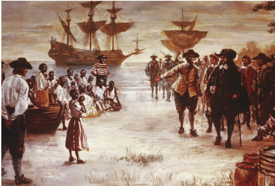
A depiction of Dutch enslavers bringing enslaved Africans to Jamestown in 1619. The first slavers' ships arrived only 12 years after the founding of the settlement, the first permanent British colony in what would become the United States.