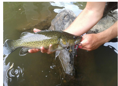
Mary River Cod