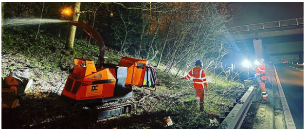
We have increased availability of night work recourses with additional lighting systems and welfare vehicles