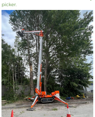
Our in house 25m tracked cheri