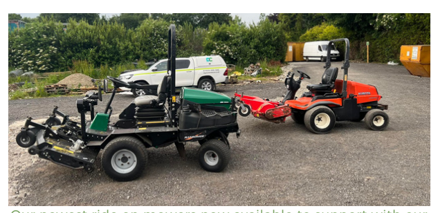
Our newest ride on mowers now available to support with our grass cutting operations

THE DC TEAM DOWNED TOOLS AND ATTENDED THE GREAT YORKSHIRE SHOW ON FRIDAY THE 18TH JULY. THE DAY WAS DEDICATED TO GIVING BACK TO A GREAT TEAM OF EMPLOYEES WHO WORK HARD CONSISTENTLY TO ALLOW US TO PROVIDE EXCELLENT SERVICES TO OUR CLIENTS. A GREAT DAY WAS HAD BY ALL AND WE HOPE TO BE BACK NEXT YEAR.