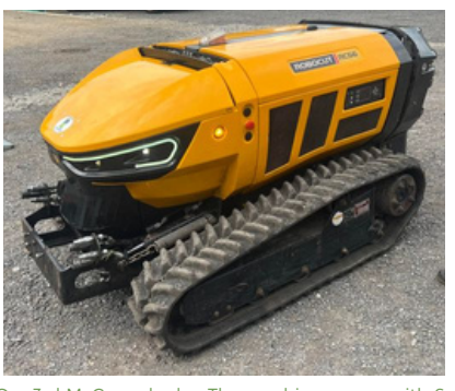
Our 3rd McConnel robo. The machine comes with 6 attachments including, stump grinder, winch, rotivator, and a variety of flails.

We continue to invest in our vehicles and equipment, welcoming new boats, cherry pickers, work vehicles, robo flails, ride on mowers and other specialist equipment to our fleet. We are continuously looking for innovative ways to complete jobs in an efficient and cost effective way .