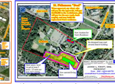
Alternative site, never happened.