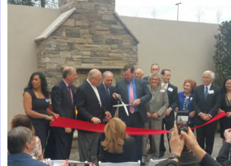
Ribbon cutting , 4/18