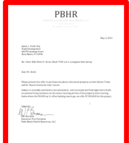
Original cover letter. 2011!

Alternative development by Lennar of the site, 2010 or so. Never happened, obviously.