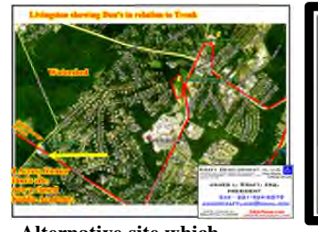
Alternative site which turned into a temple instead.

Alternative design for northern part of site by a builder who did not close for $14M before the crash- on 4 acres!