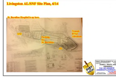
Site plan, as approved. Complicated by land swap. Verv creative deal!