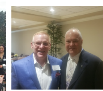
Me with the developer.