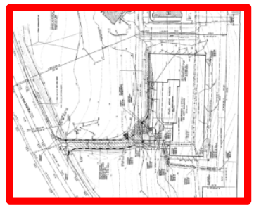
Alternative site which still has not been built: competition!