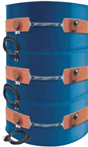
Sold per Each