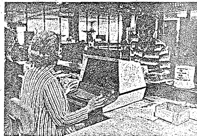
HUNTINGTON BEACH'S new library is equipped with modern devices, including computers and microprint readers, to assist users and staff alike.