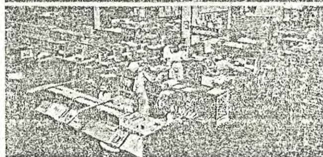
SYMBOL OF A CITY'S GROWTH — Three views of library, near corner of Talbert and Goldenwest, officially called Huntington Beach Library, Information and Cultural Resource Center. Facility has been open more than a year now.