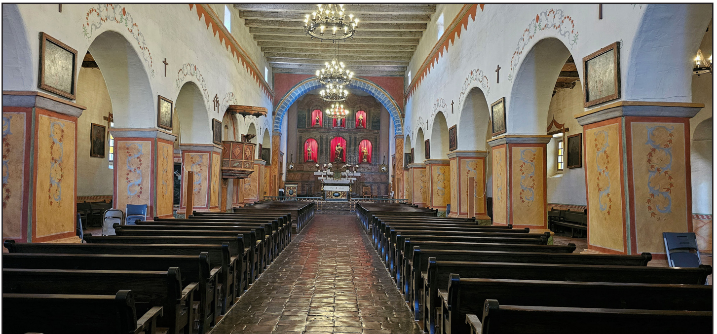
Mission San Juan Bautista