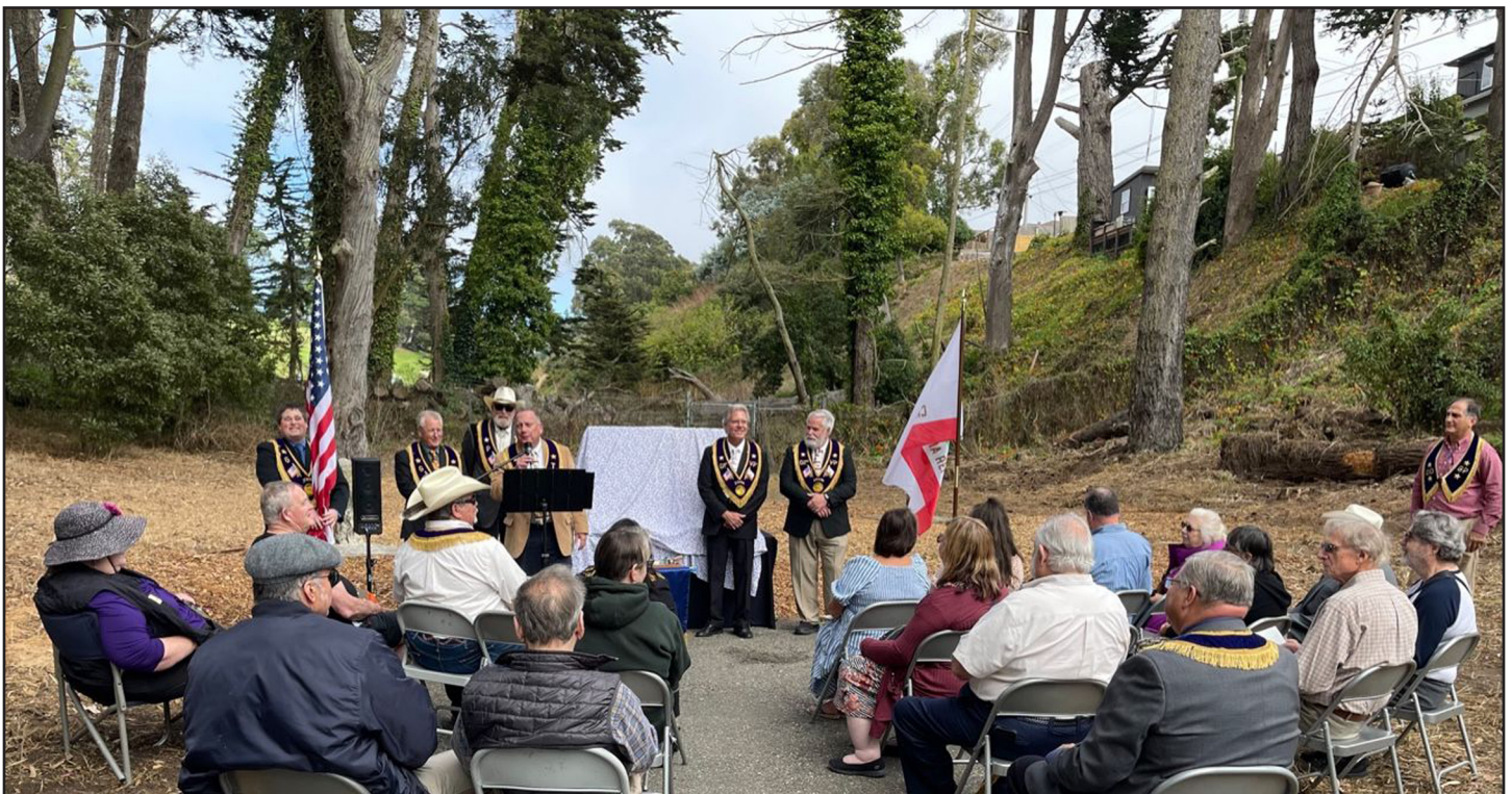
On September 8, Grand Officers of the Native Son rededicated the site near San Francisco's Lake Merced of the Broderick-Terry, reputed to be "the last noted American duel" on September 13, 1859. Broderick was killed. The Native Sons of the Golden West Historic Landmarks Committee placed the original plaque in 1917.