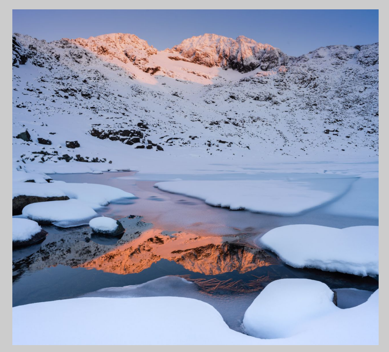
Another shot where I had to climb for 3 hours to be in place for sunrise

I can't really comment too much on the long term durability having only used it for 3 months but they have been pretty intense and I can't see any obvious problems or even any real sign of wear and tear. It is a new toy and as such I have probably mollycoddled it a bit more than usual; but the only extra protection has been the thin blue dust bag which I have used to keep it in on the outside of my rucksack to give a little protection from scratches etc. If I've used the tripod in the sea then I've washed it off with fresh water. Apart from this, I just use the tripod and replace it