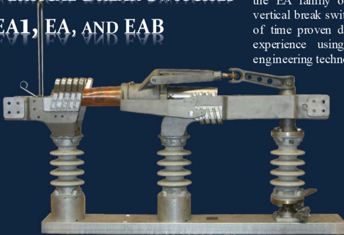
15kV, 4000A - EA

Available in ratings up to 4000A and 362kV, the EA family of aluminum and copper vertical break switches offers over 50 years of time proven design and manufacturing experience using the latest CNC and engineering technology.