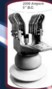
2000 Ampere, 5" B.C.