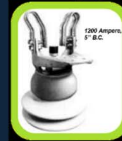
1200 Ampere, 5" B.C.