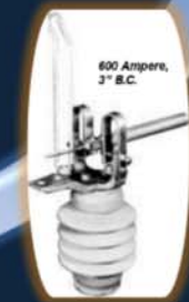
600 Ampere, 3" B.C.