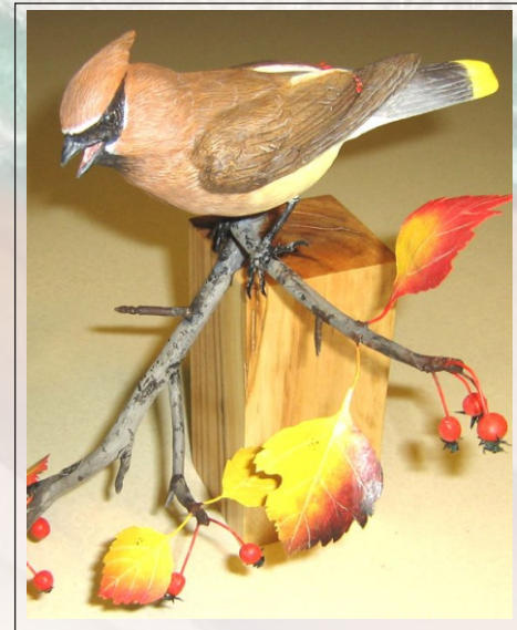
Cedar Waxwing