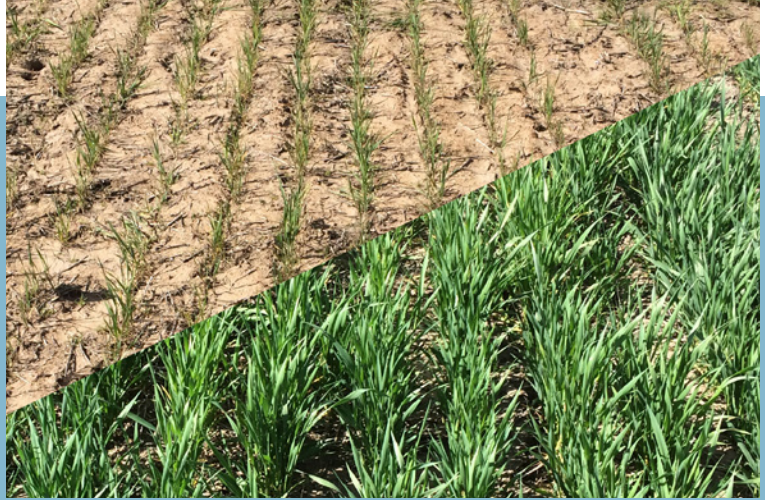
The growth of wheat in Eastern Washington in soils amended with biochar vs. unamended soils.

In 2013, the USDA-ARS established trials at the Gady Farm to compare the impacts of the seed cleaned