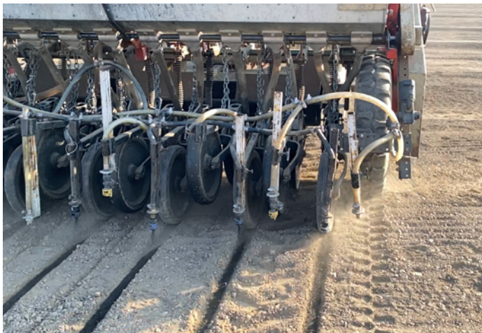
Biochar slurry application using a sprayer.

Micronized biochars can be suspended in water and injected into the root zone of perennial crops or fertigated, which could provide a slow but steady method of adding biochar to the root zone via irrigation water.