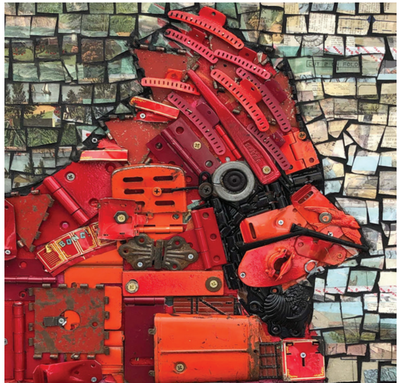
AMY WEH, 2-D MIXED MEDIA & MOSAIC