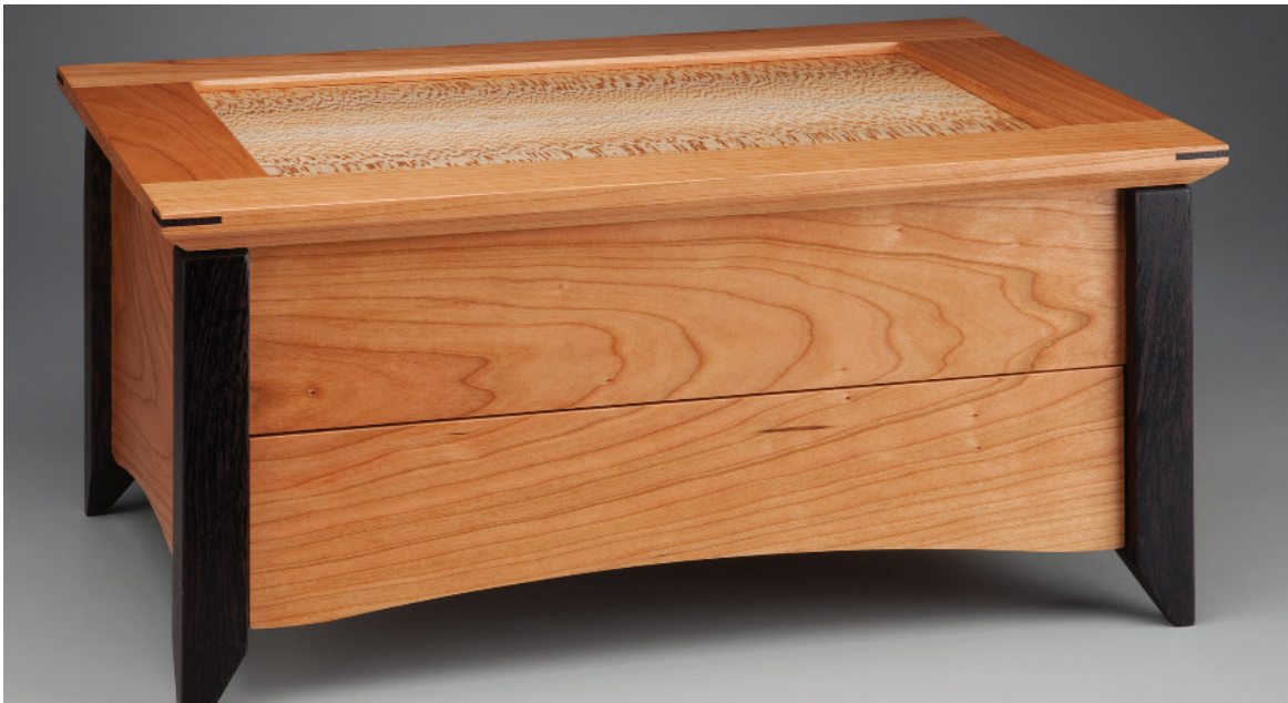
WILL WIPPERFURTH, FINE WOODWORKING