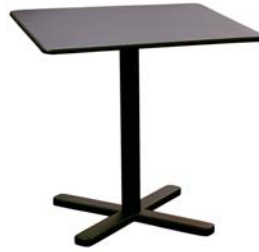
TILT NESTING TABLES