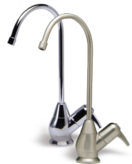
OPTIONAL Chrome and Brushed Nickel Faucet Finishes