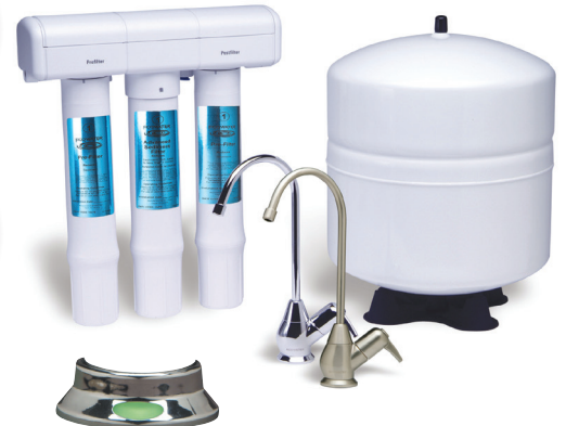
OPTIONAL Electronic Monitoring Faucet Base