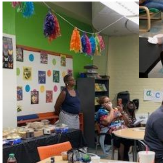
August 2020 at The Village at 3060