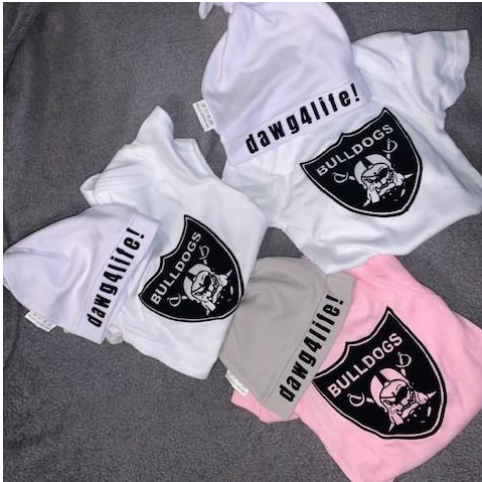
Each baby recieved a onesie and hat