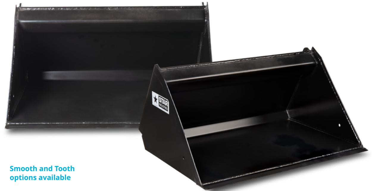
Smooth and Tooth options available