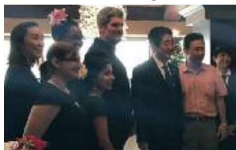
Japanese Prime Minister Shinzo Abe and 25 of his delegates had a private lunch at Signature Prime Steak & Seafood when he was in town to visit Pearl Harbor with President Obama and took the time to shake the hand of every person in the restaurant before he left.