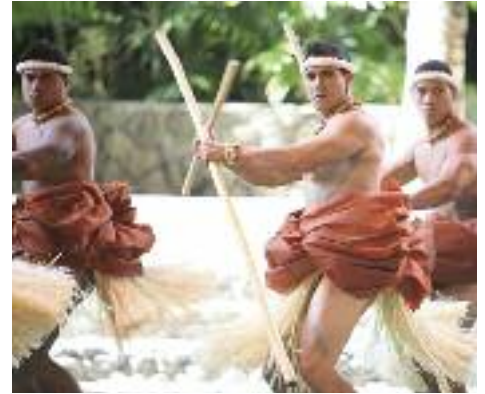
The men of Ke Kai O Kahiki during last year's Moanikeala Festival.