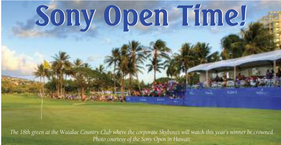
The 18th green at the Waialae Country Club where the corporate Skyboxes will watch this year's winner be crowned.

The origins of golf are unclear and much debated. However, the modern game of golf is generally considered to be a Scottish invention. A spokesman for the Royal and Ancient Golf Club of St. Andrews, one of the oldest Scottish golf organizations, states, "Stick and ball games have been around for many centuries, but golf as we know it today, played over 18 holes, clearly originated in Scotland."