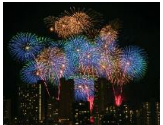
The fireworks display above Waikiki will take place Sunday night, March 12th at 8:30 p.m.

Finally, the Honolulu Festival draws to a close with a spectacular firework show off Waikiki Beach. As many of you are already aware, the city of Nagaoka, Japan is famous for its amazing