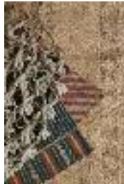
Design motifs and patterns showcased at Bishop Museum's latest exhibit.

Honolulu's arts and cultural scene this March is all about patterns. Visual configurations inspired by nature that make you think, pentatonic arrangements found in rock music that make you want to sing and orchestral compositions that make you want to cry. In other words, this month is about artistry (when is it not?) in the visual and performing arts.