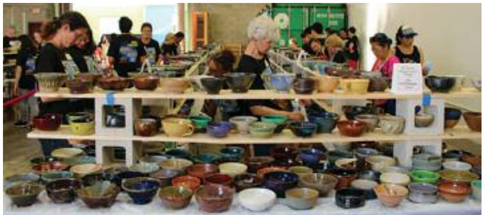
Shoppers search for the perfect bowl that matches their style during the 2015 Empty Bowl Hawaii that was hosted in Kaka'ako