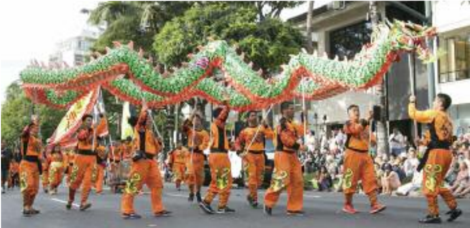
Taiko drummers perform at the 2016 Honolulu Festival.