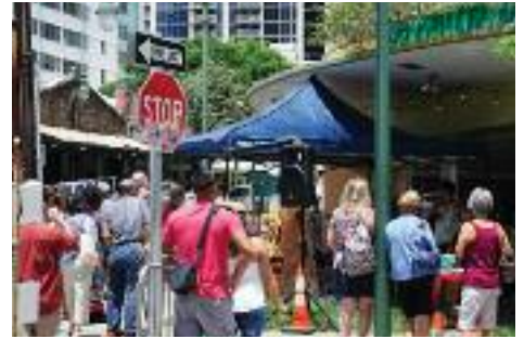
The Walk on the Wild Side takes place on March 11th during DiscoverArt Second Saturday offering visitors plenty to enjoy.

Chinatown is the place to wander and adventure on Saturday, March 11th from 11 a.m. to 5 p.m. Galleries, restaurants, shops, three stages of entertainment and a heard of artists are all participating in the National Kidney Foundation Walk on the Wild Side.