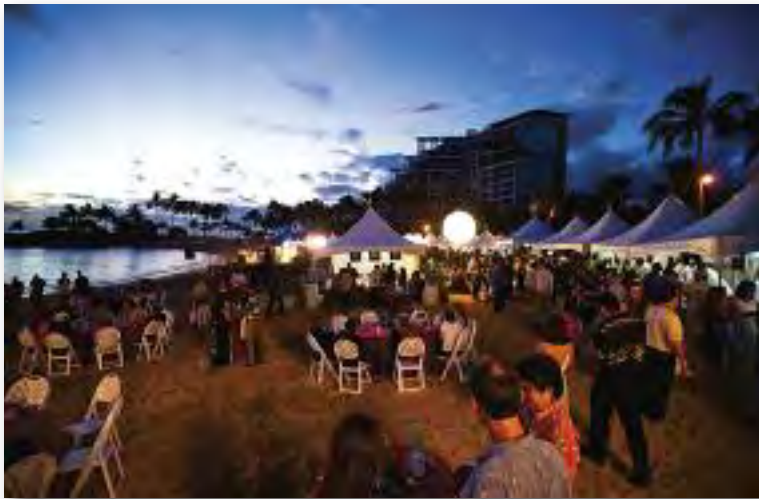
The festival's finale, Savory Ever After will take place fronting the lagoon in Ko Olina on Saturday, September 8th, 2013.

The 3rd Annual Hawaii Food & Wine Festival, September 1st through 9th, is a culinary adventure beyond the wildest expectations of your taste buds. Held on both Oahu and Maui this year, this is the who's who of internationally acclaimed master chefs, plus four master sommelier, five mixologists and more than ten top-tier winemakers from Hawaii, the U.S. mainland, Japan, Korea, Taiwan, Philippines and Australia. Stir in the newest ingredient, vodka, with an Exploring Vodka seminar. Saying "something for everyone" seems a bit too mundane considering all the amazing info and various events listed at HawaiiFoodandWineFestival.com .