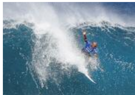
11x World Champion Kelly Slater navigates a tricky wave at the 2016 Billabong Pipe Masters.

Once again we are on the cusp of welcoming in our winter season of big wave surfing. Winter in the Hawaiian Islands means it's time for the top echelon of pro surfers, as well as young up-and-comers ready to usurp the current champs, to migrate to our world-renowned 7-miracle mile stretch of shoreline. Ready to show off their surfing skills, they come to compete for big prizes and big wave bragging rights.