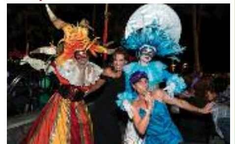
IONA Contemporary Dance Theatre' "IONAsphere," their annual fundraising event, at the Sheraton Waikiki Helumoa Pool. Attendees were transported to another world in an exciting evening that raised nearly $50,000 towards new works of art.