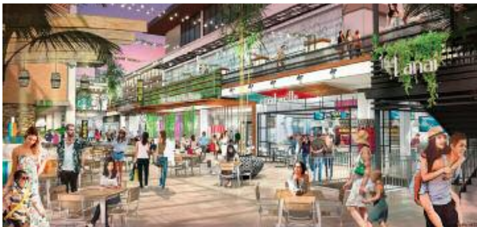
An artist's rendering of what The Lanai at Ala Moana Center will look like when it opens October 27th.

The Diamond Head Wing of Ala Moana Center will be a beehive of activity when The Lanai @ Ala Moana opens on October 27th, in the former Shirokiya space on Mall Level 2. The Lanai will offer breakfast, lunch, dinner as well as grab-and-go options, and feature seating for up to 450 guests with the option to dine inside a stylish new dining hall or outside underneath festival lighting.