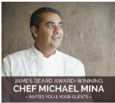
JAMES BEARD AWARD-WINNING CHEF MICHAEL MINA - INVITES YOU & YOUR GUESTS -