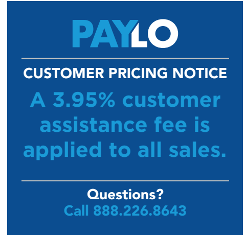
(Example of signage sticker)

Clear and conspicuous signage is required by law to be displayed at the business entry point and at the point-of-sale to easily and accurately explain the program. The customer assistance fee must be present on any generated receipts from the transaction. PayLo automates the process by applying the customer assistance fee at the time of sale. The software has been vetted and approved by all major credit card brands, state laws and federal regulations.