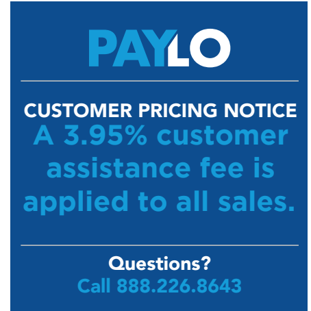
(Example of signage sticker)

Clear and conspicuous signage is required by law to be displayed at the business entry point and at the point-of-sale to easily and accurately explain the program. The customer assistance fee must be present on any generated receipts from the transaction. PayLo automates the process by applying the customer assistance fee at the time of sale. The software has been vetted and approved by all major credit card brands, state laws and federal regulations.