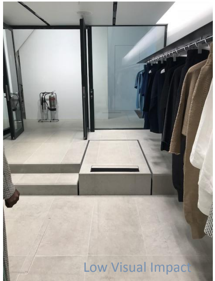
Low Visual Impact