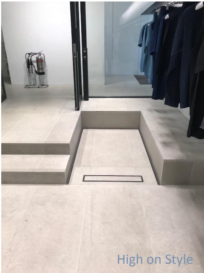
High on Style