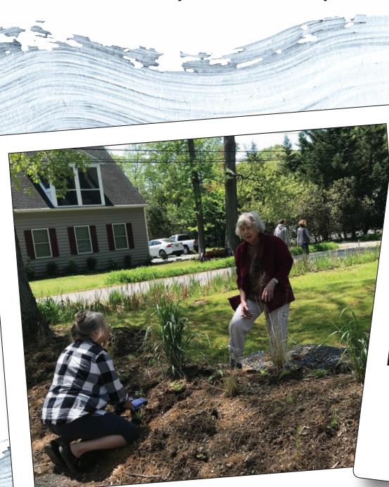
The new berm in our renovated parking lot got a major planting by volunteers to finish off the new parking lots project!

(410) 867-4486 | captainaverymuseum.org Captain Avery Museum is a 501(C)3 nonprofit organization.