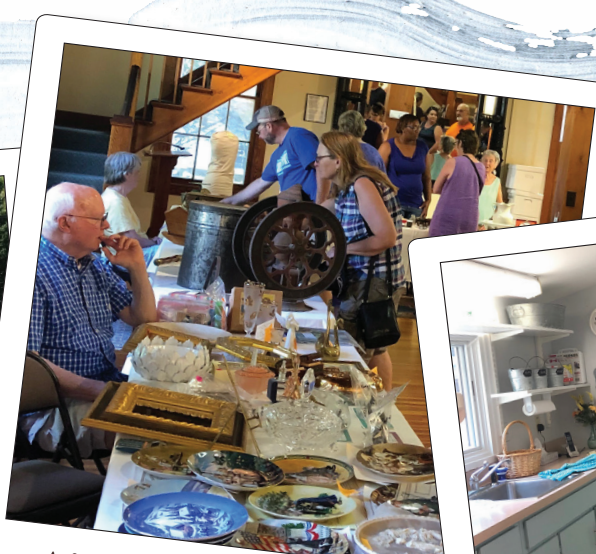
A fun crowd of antique hunters perused our offering at our July Estate Sale.