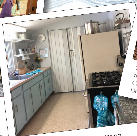
Volunteers spruced up our catering kitchen - it's freshly painted and sparkling!