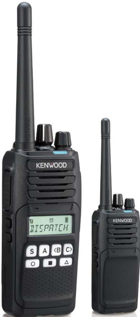
Standard Keypad model

If you are thinking of harnessing the latest digital protocols – NXDN or DMR – to enhance business efficiency or FM analog for its simplicity, the NX-1200/1300 has you covered. Our One-“K”-Fits-All solution offers the widest selection of two-way radios for everyday use. The model matrix also includes basic and keypad variations, with or without a high-contrast backlit LCD. Other features include a 7-color LED indicator and the popular KENWOOD 2-pin audio accessory connector. Plus, mixed-mode operation ensures seamless integration with legacy radios while smoothing the onward migration path to digital. But whatever your specific needs, audio quality is what determines clear voice communications – which is why KENWOOD radios are used under the most grueling conditions, like the cockpit of a racing car. Thanks to our extensive experience with professional systems, reliability is second to none. So whatever your radio requirements, KENWOOD’s NX-1200/1300 offers a single platform that’s right for you.