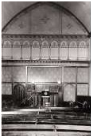
Interior before 1938

When the Chapel was built it was entered by two inner doors with side aisles and central pews. In 1938 this was changed to a centre aisle with replacement pews each side. These are still used today, with the addition of seat cushions — the thin felt coverings were a bit hard! A couple of years ago we replaced the inner doors, giving more light and making the entrance more welcoming. On the topic of light, oil lamps were used till 1921 when electricity was installed. There were no sound systems in 1846, preachers would have been expected to speak up but gained some help from the ceiling design. Now we have wireless microphones, a hearing loop system, and can transmit live video services! More on facing page.