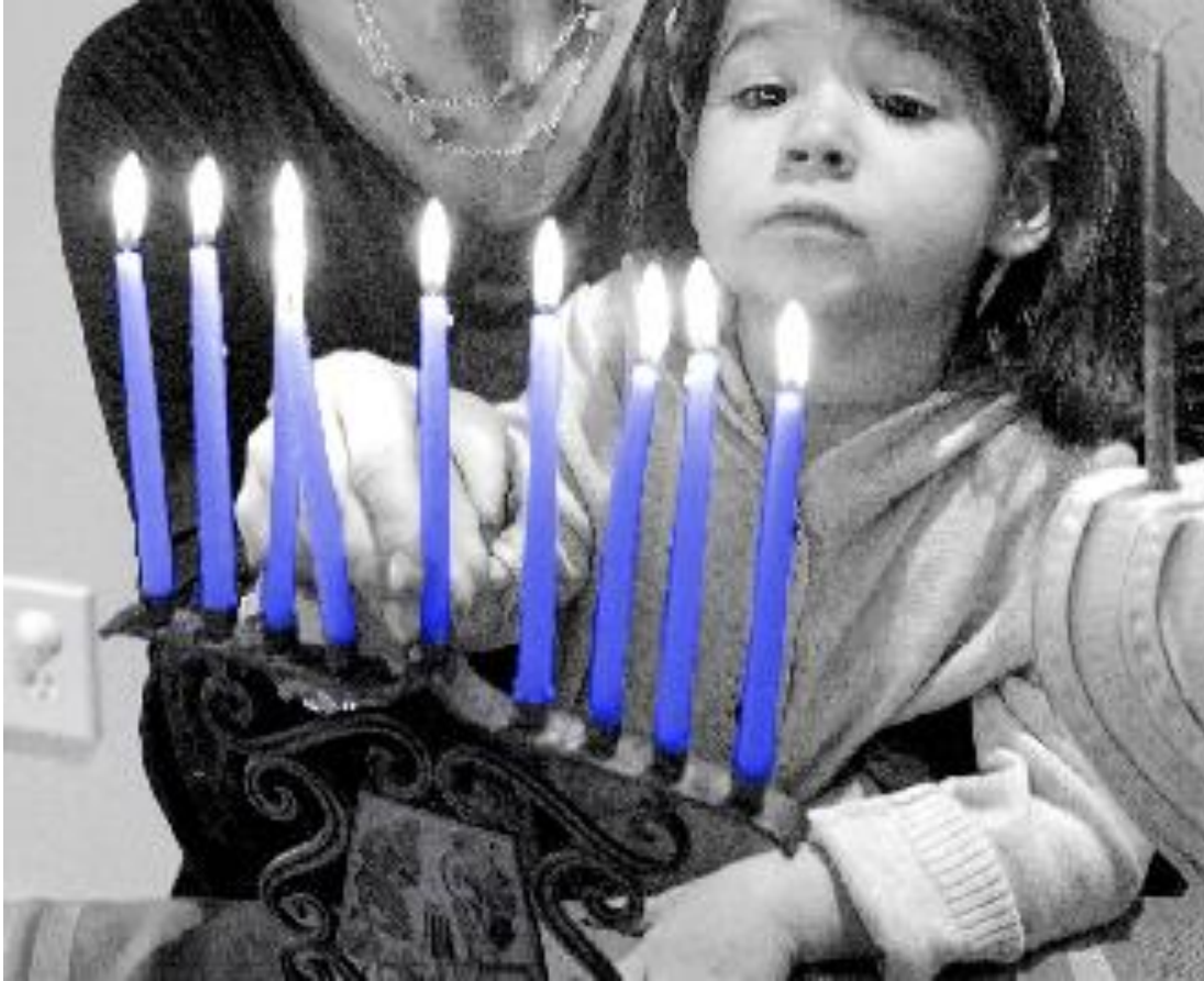
The evening of Dec. 10 marks the start of Judaism's eight-night Festival of Lights, Hanukkah.

The confusion over the spelling comes because the name of the holiday is a Hebrew word, and the English transliteration isn't totally clear. According to the Oxford English Dictionary, there are 24 spellings for Hanukkah, during which Jews light candles on a menorah to celebrate the miracle of a one-day oil supply lasting eight after the Maccabean Revolt in the second century B.C.