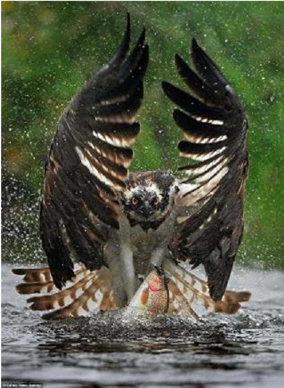
Wildlife photographer Bill Doherty