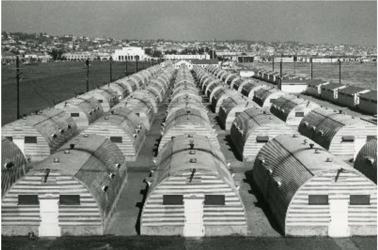
At the outbreak of the Korean War there were 300 recruits at the Depot. By April 1952 the recruit strength was more than 15,000 and the total strength of the post more than 23,000.

The first purpose-built Marine Corps base was part of an early century military boom that forever changed San Diego