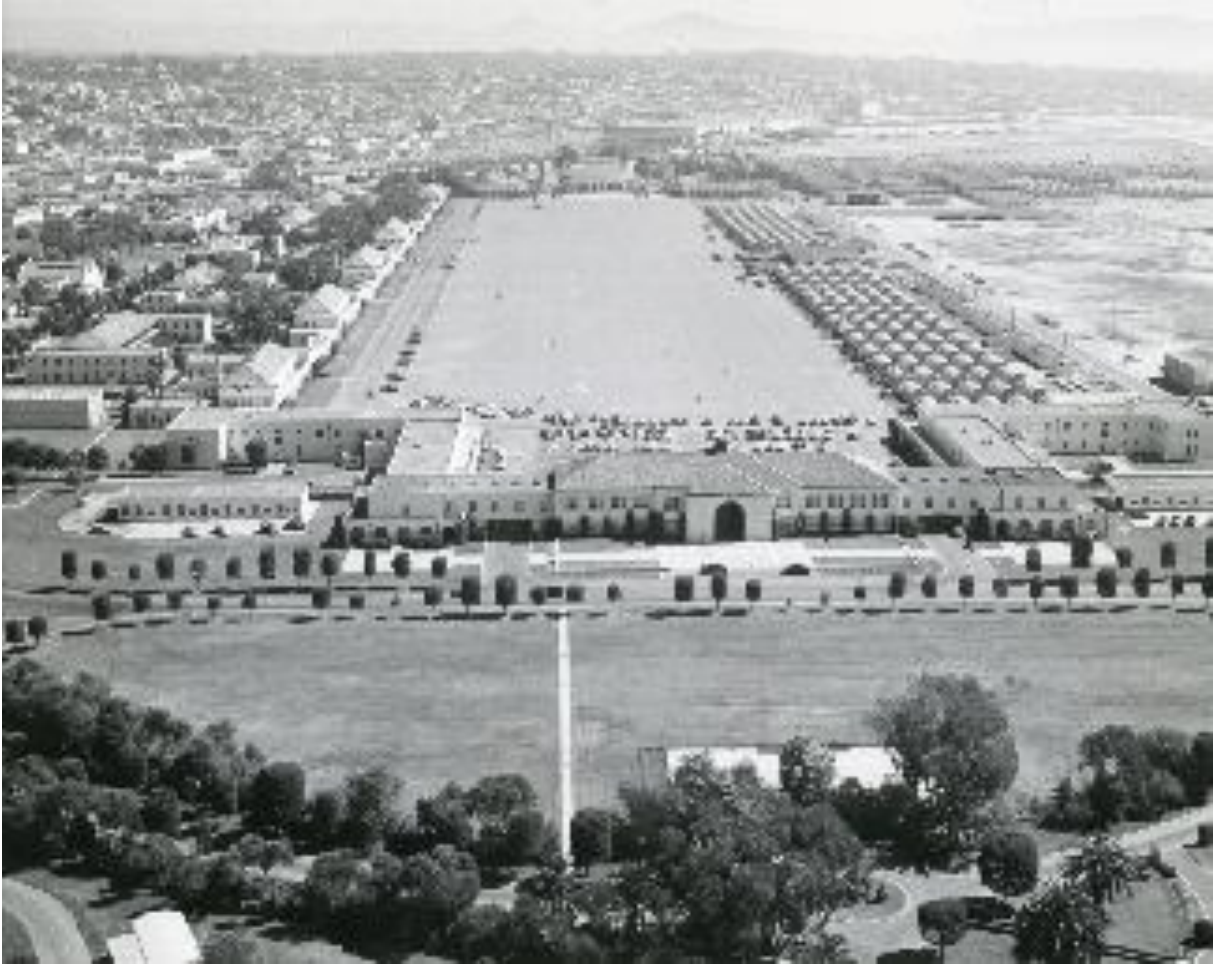
Aerial photo of the Marine Corps Recruit Depot in San Diego in 1958.