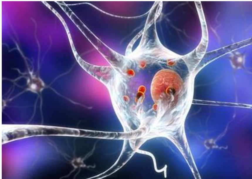
Parkinson's Disease at a cellular level: Recent research - Medivizor