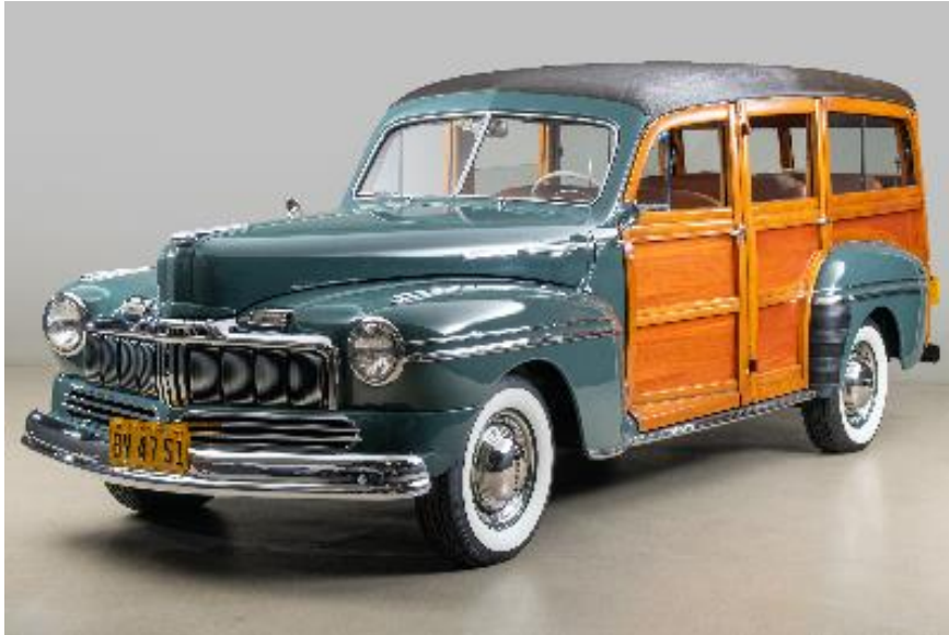
'47 Merc Woodie...Cawabunga baby