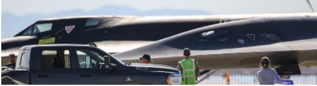
Darkstar parked next to an SR-71

As already extensively reported, the Darkstar hypersonic test aircraft featured in the opening scenes of blockbuster "Top Gun: Maverick" movie was on static display at Edwards Air Force Base during today's Aerospace Valley Open House, Air Show and STEM (Science, Technology, Engineering and Math) Expo.