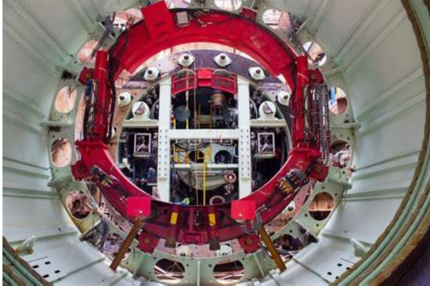
Musk's Tunnel Boring Machine Trenchless.com

Elon Musk and San Bernardino County's transportation agency began exclusive negotiations this week on construction of an underground people-mover from the Metrolink train station in Rancho Cucamonga to Ontario International Airport. If the project moves forward, operation could begin in late 2023 or early 2024.