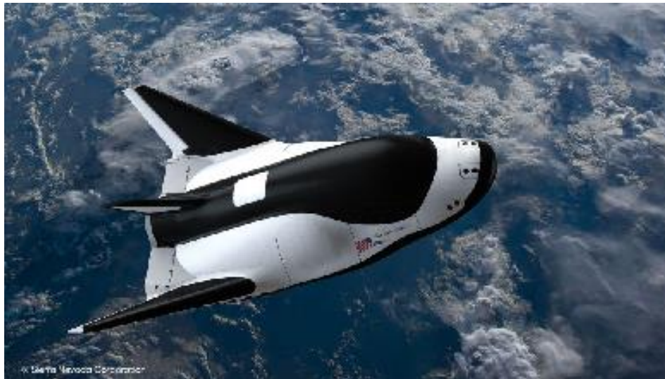
Artist's illustration of Sierra Nevada's Dream Chaser space plane in orbit.