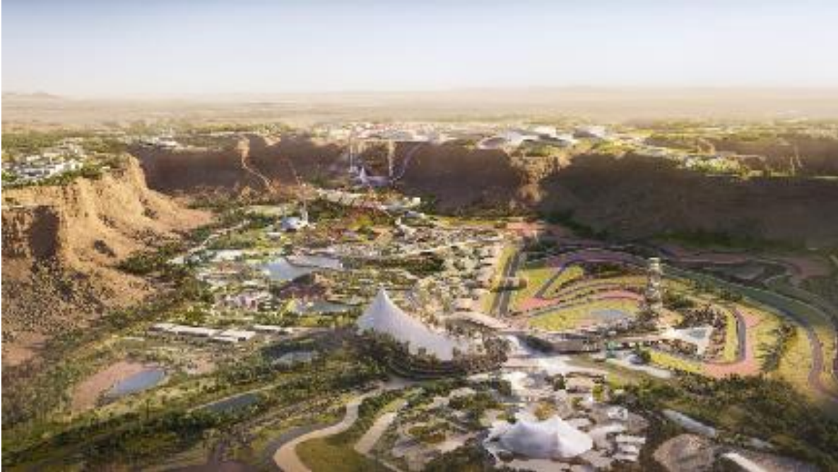
A rendering of Six Flags Qiddiya, due to open in Saudi Arabia in 2023.

(CNN) — A roller coaster now under development in the Middle East is set to smash existing records for speed, height and track length.