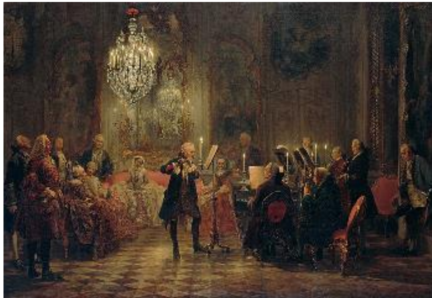
This painting by Adolph von Menzel depicts Frederick the Great playing the flute as C. P. E. Bach accompanies on the keyboard.

While few would argue the compendium of his works rivalled his papa's, they showed the brilliance that set him above many of the more notable composers of his era.