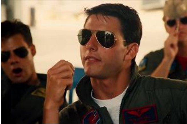
Ray-Ban sunglasses were featured prominently in Top Gun

Many well-known product placements in film were unpaid: