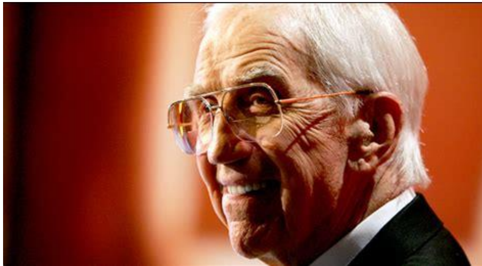
Edward Leo Peter "Ed" McMahon, Jr. (March 6, 1923 – June 23, 2009)

American comedian, actor, singer, game show host and announcer. He is most famous for his work on television as Johnny Carson's sidekick, a position he held for over 30 years.