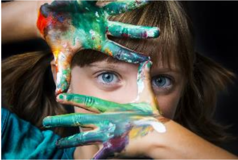
A young girl with watercolor on her hands.

Creativity could be one of the main reasons Homo sapiens survived and dominated over related species such as Neanderthals and chimpanzees, according to a new study.