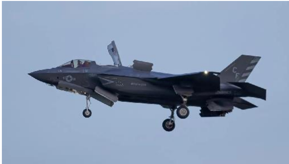
The CAG bird of VMFA-211 lands at RAF Lakenheath on Apr. 26, 2021.